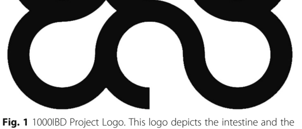
multifaceted character of the project

Every 1000IBD participant has a unique pseudo-anonymized 1000IBD-identifier that is used to link all clinical phenotypes and molecular data layers. A model of the 1000IBD dataset is depicted in Fig. 2.