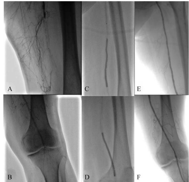
Figure 2 Prolonged high-pressure angioplasty in a severely calcified lesion. (A-B): Baseline digital angiography in a 73-year old woman with severe coronary disease and ischemic heart cardiomyopathy and severe claudication demonstrating a long calcified occlusion of the superficial femoral and popliteal arteries; (E-F): angiographic result after prolonged high pressure angioplasty with a Dorado balloon (C-D).

more dilations until the results were considered acceptable by the operator (< 30% residual stenosis on angiography).