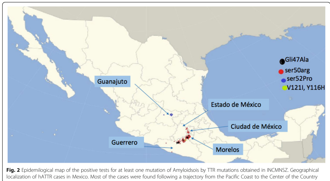
Fig. 2 Epidemiological map of the positive tests for at least one mutation of Amyloidosis by TTR mutations obtained in INCMNSZ. Geographical localization of hATTR cases in Mexico. Most of the cases were found following a trajectory from the Pacific Coast to the Center of the Country

different from sporadic hATTR-amyloid patients. The similarities are based on the following findings: 1) the onset of clinical manifestations is very early (35 years) compared to the amyloidosis reported in populations of sporadic origin where the disease presents patients over 50 years of age [1, 2]; 2) the picture is more aggressive in males than females, a prototypical characteristic of the endemic populations of Portugal [2]; and 3) clinical manifestations appear earlier in younger generations, a phenomenon that is also common only in endemic populations, somewhat similar to the anticipatory phenomenon seen in triplet diseases [27–34].