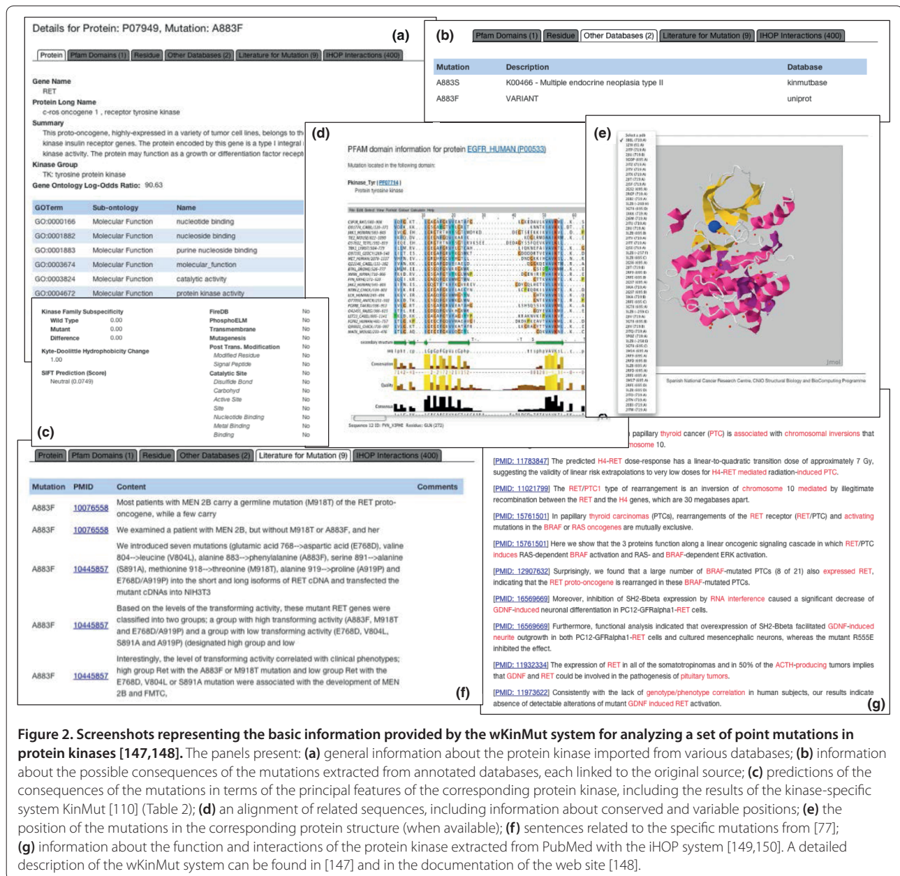
Figure 2. Screenshots representing the basic information provided by the wKinMut system for analyzing a set of point mutations in protein kinases [147,148]. The panels present: (a) general information about the protein kinase imported from various databases; (b) information about the possible consequences of the mutations extracted from annotated databases, each linked to the original source; (c) predictions of the consequences of the mutations in terms of the principal features of the corresponding protein kinase, including the results of the kinase-specific system KinMut [110] (Table 2); (d) an alignment of related sequences, including information about conserved and variable positions; (e) the position of the mutations in the corresponding protein structure (when available); (f) sentences related to the specific mutations from [77]; (g) information about the function and interactions of the protein kinase extracted from PubMed with the iHOP system [149,150]. A detailed description of the wKinMut system can be found in [147] and in the documentation of the web site [148].

than individual mutations themselves, combinations of mutations provide cell lineages with an advantage in terms of growth and their invasive capabilities. Given the complexity of this process, more elaborate biological models are needed to account for the role of networks of mutations in this competition between cell lineages [74].