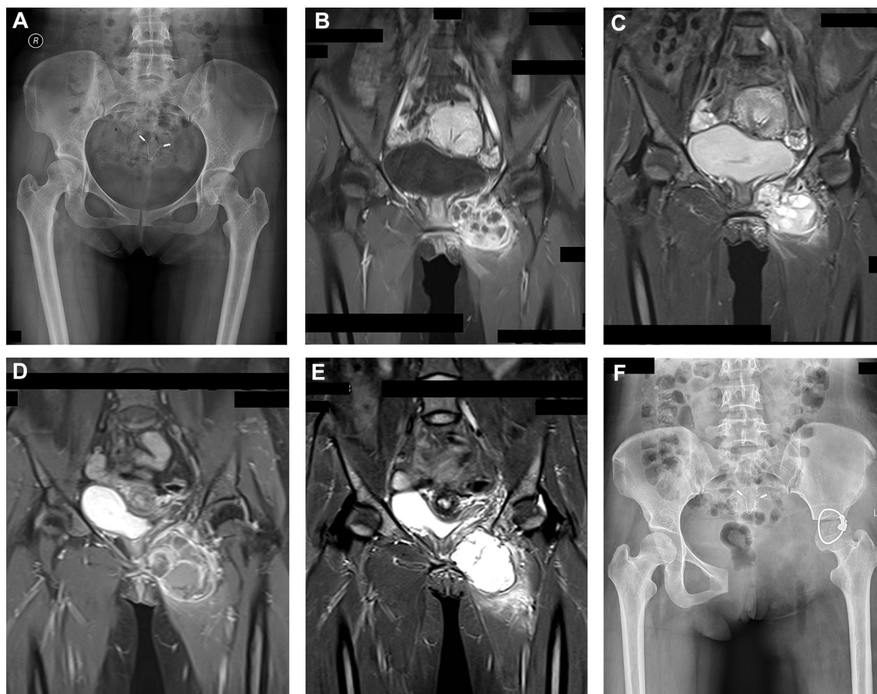
Figure 2 (A) Pelvis X-ray of a 36-year-old female with an osteosarcoma in the pubis. (B) and (C) Fat-saturated T1- and T2-weighted coronal slices of contrast-enhanced MRI showing the maximum diameter of the tumor at the first diagnosis, which showed heterogeneous enhancement, thick septa and obscure boundaries of the tumor. (D) and (E) MRI reevaluation after completion of the neoadjuvant CAI + MSC regimen, showing thin septa, clear boundaries and stable disease according to RECIST 1.1 with a decrease in the tumor diameter. (F) Pelvis plain X-ray of this patient. (The identifiable captions in these images are occluded.).

neoadjuvant regimen, including alleviation of pain. In terms of tumor response measurement per RECIST 1.1, 4 patients had PR and 5 had SD after routine neoadjuvant CAI + MSC administration. Three patients had to undergo resection surgery ahead of schedule because of PD, as shown by CE-MRI after neoadjuvant CAI + MSC administration. No patient demonstrated CR.