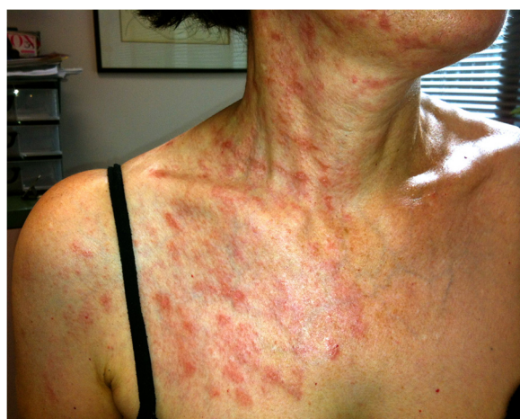
Figure 1 The sharp midline delineation of the patient's rash on day 24.

was diagnosed. Valacyclovir was extended to 10 days and prednisone started. A neuro-ophthalmology referral was made. On day 46, the patient returned showing significant improvement. She could smile symmetrically and close her right eye completely.