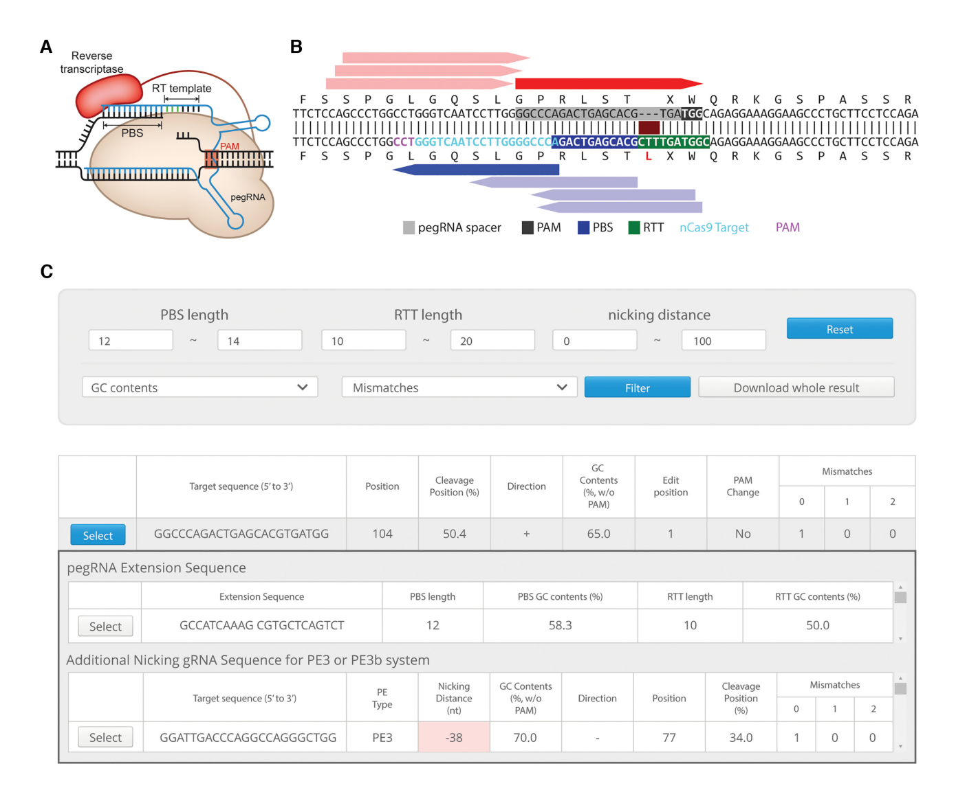
Figure 1. Schematic of a PE and the PE-Designer results panel. (A) Schematic of a PE, highlighting the pegRNA structure. (B) Interactive summary figure on the PE-Designer results page. The possible pegRNA target sequences are colored red and additional ngRNA sequences are colored blue. Each bar can be clicked to select that target sequence. When the amino acid sequence is changed, the altered residue is colored red. (C) Table of possible target sequences provided by PE-Designer. Checking the select button next to a target sequence displays a list of pegRNA extension sequences and additional ngRNA sequences. A red background means that the target is not recommended because the indicated parameter is unfavorable for prime editing.

ing insertions, deletions, and substitutions in the targeted sequence without a need for any donor DNA (17). Because of their versatile editing abilities, PEs are attracting a great deal of attention in the genome editing field (18-21), but are more complex in design than other related tools such as CRISPR nucleases and BEs; furthermore, the analysis of PE-generated results requires special considerations. PEs use prime editing guide RNAs (pegRNAs) that are programmed with information about the desired mutation and are more complex than the guide RNAs used with other CRISPR-derived tools. pegRNAs contain a protospacer sequence for recognizing the target sequence, a reverse transcriptase template (RTT) that contains the desired edit, and a primer binding site (PBS) for the activation of reverse transcriptase. Several types of PEs have been developed. In contrast with PE2, which requires only a pegRNA, PE3 also requires a nicking guide RNA (ngRNA) to increase the