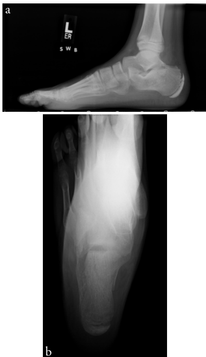
Figure 1. Injury to left calcaneus is shown in a) lateral and b) axial view. This boy was 12.75 years old at the time he was injured by falling from monkey bars at a school playground. The calcaneal apophysis is clearly evident.

1 The data for adults is a subsample that includes only displaced, intra-articular fractures in adults from the group documented by ref. 12. Böhler's angles were assessed on all individuals for whom injury, post-operative, follow-up and contralateral radiographic views were available (n=70). 2 As defined by Letoumel's method.