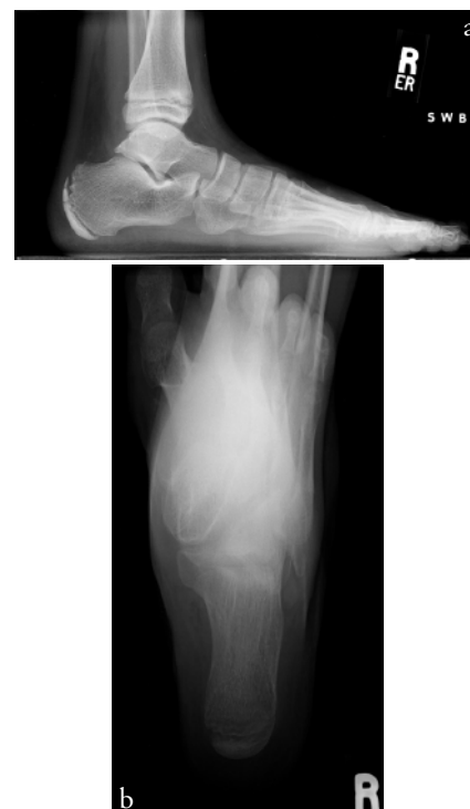
Figure 5. Uninjured right calcaneus shown in a) lateral and b) axial view. Note the unfused apophysis.

hardware removal one years after the injury. Böhler's angle for the injury, post-operative, follow-up and contralateral conditions, and the change in Böhler's angle between injury and post-operative exams, was not significantly different between children and adults ( p>0.05 ). The degree of posterior facet displacement that was seen in the skeletally immature group was as substantial as that seen in adults. Even the child with an injury Böhler's angle of 35^\circ was substantially displaced, because his contralateral angle was 49^\circ . Maintenance of reduction was confirmed on follow-up radiographs in both groups. Notably, none of the skeletally immature patients have experienced a collapse of the posterior facet and failure of the buttressing hardware. Although this event is rare in adults, it does occasionally occur and, when it does, is difficult to treat. Six adults in this group experienced a change between post-operative (average: 24.8^\circ ) and follow-up (average: -1^\circ ) Böhler's angles. These patients had substantial injuries but they were not unusual in any of their injury or other characteristics. In retrospect, we believe that their bone quality was poor, although we do not have the studies to confirm this assumption. We recommend fixed angle (locking) implants and a longer period of protected weightbearing for patients presenting with poor bone quality.