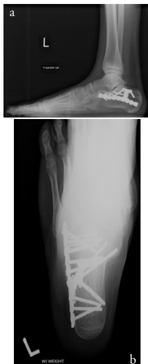
Figure 4. Healed fracture with implants in place after 1.5 years shown in a) lateral and b) axial view. Note that the apophysis is now fused.