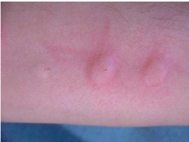
Figure 2 The typical skin reaction in a positive Casoni Test.