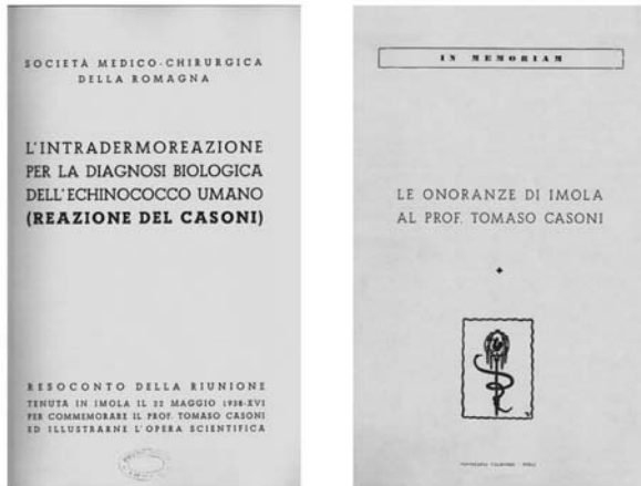
Figure 4 The cover pages of the two small booklets issued to commemorate the life and work of Tomaso Casoni.