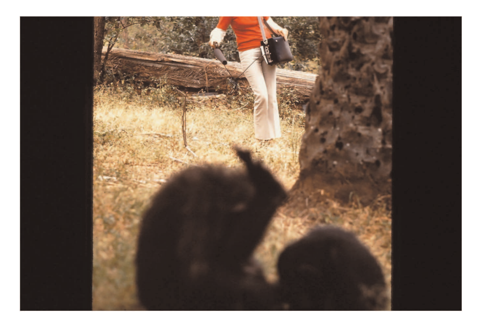
Figure 2. The recording situation of the chimpanzee vocalizations in the Kakombe valley in the feeding area (see Figure 1b). This was the open place where Jane Goodall fed the chimpanzees. At a distance between 5–15 meters the recordist (red sweater) was carrying a Nagra sound recorder (full track mono, 19 cm/s) and pointed a Sennheiser MKH 815T directional microphone (covered with a windhose) at the chimpanzees (shaded figures in the foreground).

specification of the measurement behind the 5 star system, see the Technical Validation section. Notes include the names of the vocalizing individual(s) together with the vocalization(s) of each individual and the behaviour and situation surrounding the vocalizations. Many recordings contain multiple calls by multiple animals. This means the sample size is overall quite large.