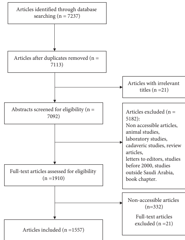
FIGURE 1: Schematic presentation of the review process.

2.2. Study Selection. This study included all clinical-based dental, oral, and maxillofacial studies having at least one author with Saudi dental affiliation (affiliated address in Saudi Arabia). We included studies conducted in Saudi Arabia that were published in English in any medical, dental, public health, or health science journal between January 2000 and May 2020. The authors excluded benchwork studies, animal and cadaveric studies, narrative reviews, qualitative studies, expert's opinion, letters to the editors, editorials, comments, book chapters, studies that recruited population only from outside Saudi Arabia, and studies that had no access to their full text (Figure 1). The two reviewers independently graded the studies by using the criteria of a modified Oxford Centre for Evidence-Based Medicine [16]. The articles were ranked from Level I (e.g., randomized controlled trials) to Level IV (e.g., case reports), based on the modified Oxford LOE criteria (Table 1). Level V studies (e.g., animal studies) were excluded from the review process, consistent with LOE assessments used in other medical specialties [17]. The reviewers independently conducted the screening procedures and classified the articles independently. Any disagreement was resolved by discussion until a consensus was reached.