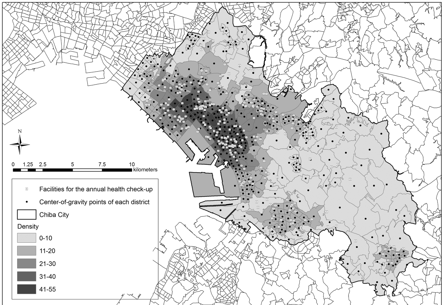
Fig 1. Locations of facilities for annual health check-ups and the center of gravity of each district.

https://doi.org/10.1371/journal.pone.0177091.g001