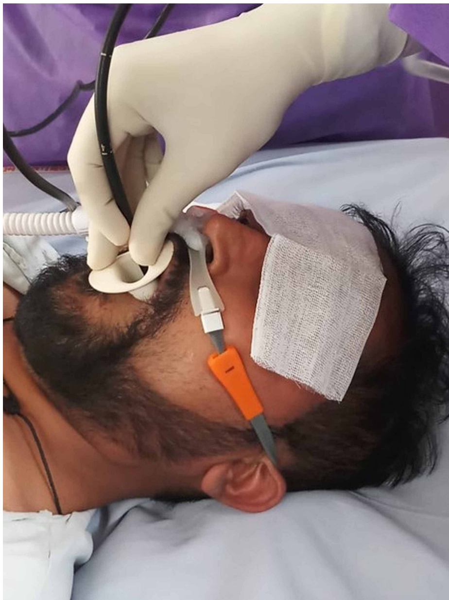
FIGURE 2: Set up showing a high-flow nasal cannula in situ with a flexible bronchoscope being inserted via the oral route

Preprocedure saturation was 99%. Flexible bronchoscopy was performed via the oral route after local anesthesia and conscious sedation with fentanyl. BAL was performed from the right lower lobe apical segment. Saturation remained at 99% for the entire procedure duration. The patient tolerated the procedure well. Postprocedure HFNC was continued for 24 hours. BAL fluid analysis showed acid-fast bacilli positivity, with positive cartridge-based nucleic acid amplification test (CBNAAT) for tuberculosis; BAL bacterial and fungal cultures were negative. The patient was initiated on a four-drug antitubercular therapy (ATT), i.e., rifampicin, isoniazid, ethambutol, and pyrazinamide, according to body weight. He improved with treatment and was discharged home on ATT after two weeks of hospital stay.