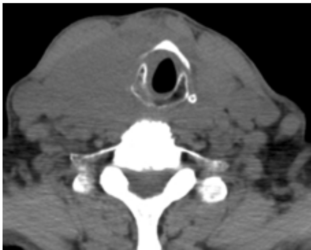
Figure 1. The CT Scan Showing Lack of Significant Tracheal Compression

at admission, the patient's vital signs were stable, with bilateral large and firm masses at cervical palpation, irregular heart rate, and bilaterally equal breath sounds. Given his symptoms, the patient was started on intravenous methylprednisolone. Cardiac workup and transthoracic echocardiogram showed a left ventricular ejection fraction of 65%. The cervical CT scan at admission, seen in Figure 1, revealed the enlargement of the thyroid into the anterior mediastinum, displacement of the trachea, but no evidence of tracheal compression. Flexible laryngoscopy evaluation revealed no upper airway distortion. The neck masses began to rapidly decrease in size, with concomitant symptomatic improvement with steroid administration. Repeat FNA indicated atypical lymphoid infiltrate arising in the setting of Hashimoto's thyroiditis. Flow cytometry revealed lymphoid B-cells positive for CD19, CD20, Kappa+/CD19+, and Lambda+/CD19+, and negative for CD10. The polymerase chain reaction (PCR) study of immunoglobulin heavy chain gene rearrangement showed clonal B-cells with polyclonal background. To fully characterize the tumor, the patient then underwent open biopsy with pyramidal lobe and isthmus excision. Histological analysis of the specimen revealed diffuse large B-cell lymphoma positive for CD19, CD20, and monoclonal kappa light chains, but negative for CD5 and CD10, in the presence of thyroiditis.