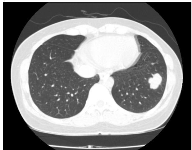
Fig. 1. A 2.7-cm well-defined lobulated nodule observed in the basal segment of the left lower lobe in chest computed tomography.

cytokeratin in a necrotic background. We believed that the characteristics of the nodule indicated squamous cell carcinoma. In 18-fluorodeoxyglucose positron emission tomography, the