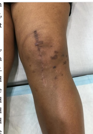
Figure 3: Skin changes at annual clinic follow-up.

We performed the right TKR first, using a midline skin incision and a medial parapatellar arthrotomy. Intramedullary alignment jigs and a measured resection technique were used to prepare the bone and achieve balance in flexion and extension. The bone was cleaned with pulsatile lavage and the components cemented in place,