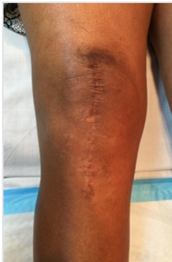
Figure 2: Improvement in the skin following application of a topical corticosteroid.

well-functioning joint replacements, despite the absence of clinical allergic reactions to their implants. Therefore, one can appreciate that the relationship remains relatively obscure.