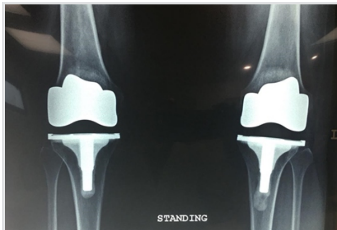
Figure 4: Anterior-posterior radiograph at 1 year post-operative.