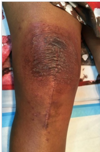
Figure 1: Eczematous skin reaction after the right total knee replacement.