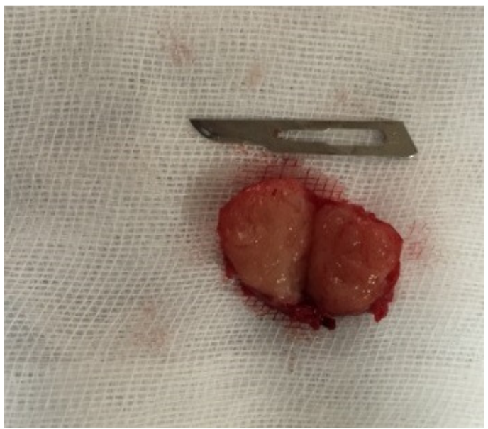
Figure 4 : Surgical specimen after procedure