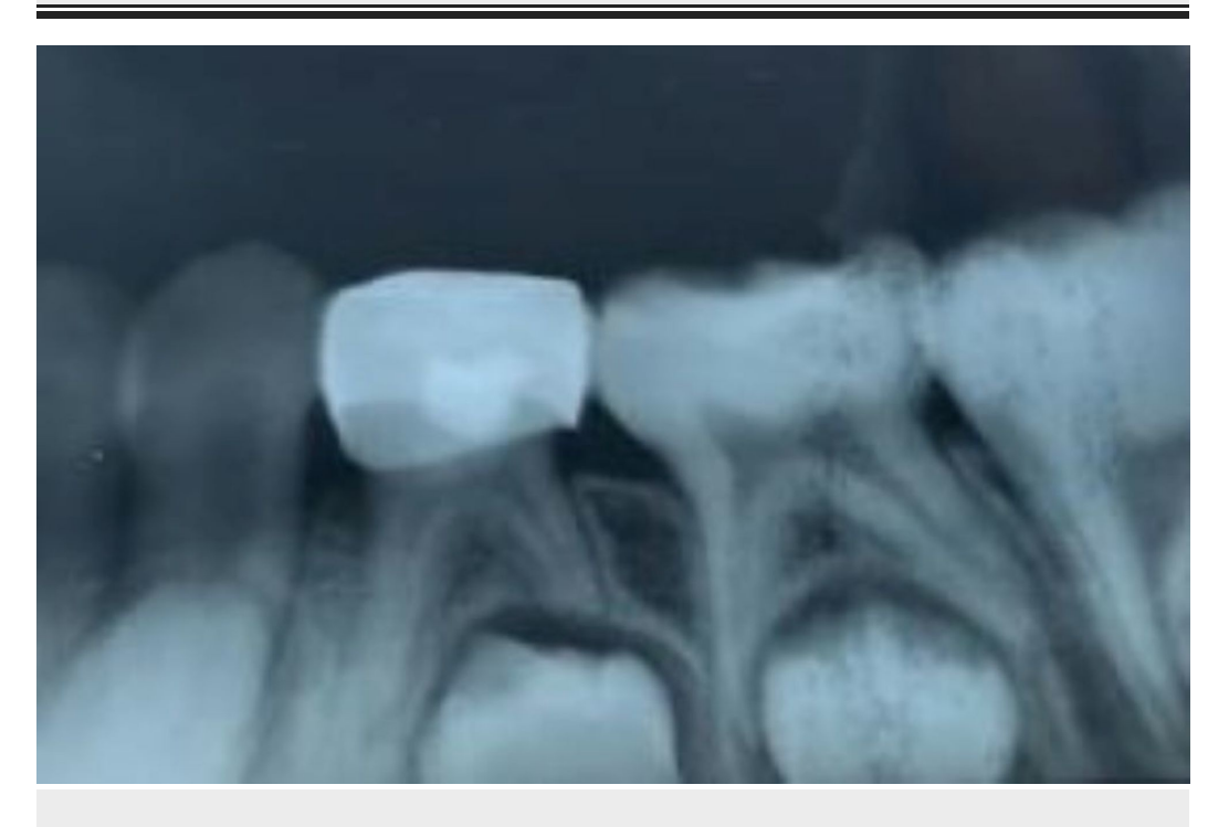
FIGURE 6: Three months follow-up after the placement of Biodentine