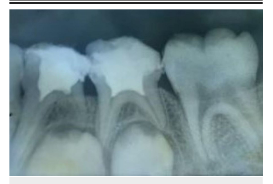
FIGURE 2: Postoperative radiograph after the placement of MTA