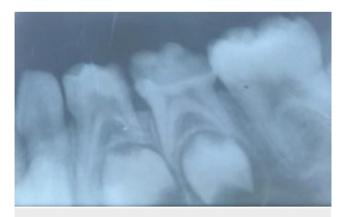
FIGURE 1: Preoperative radiograph for the placement of MTA