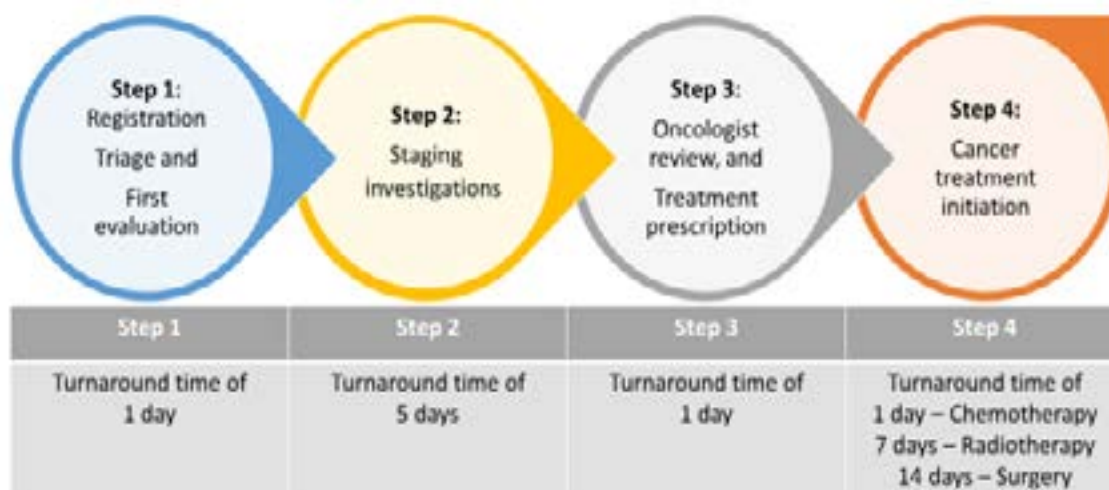
Figure 2: Stepwise processes outlining the cancer care pathway at the UCI and ideal turnaround times.