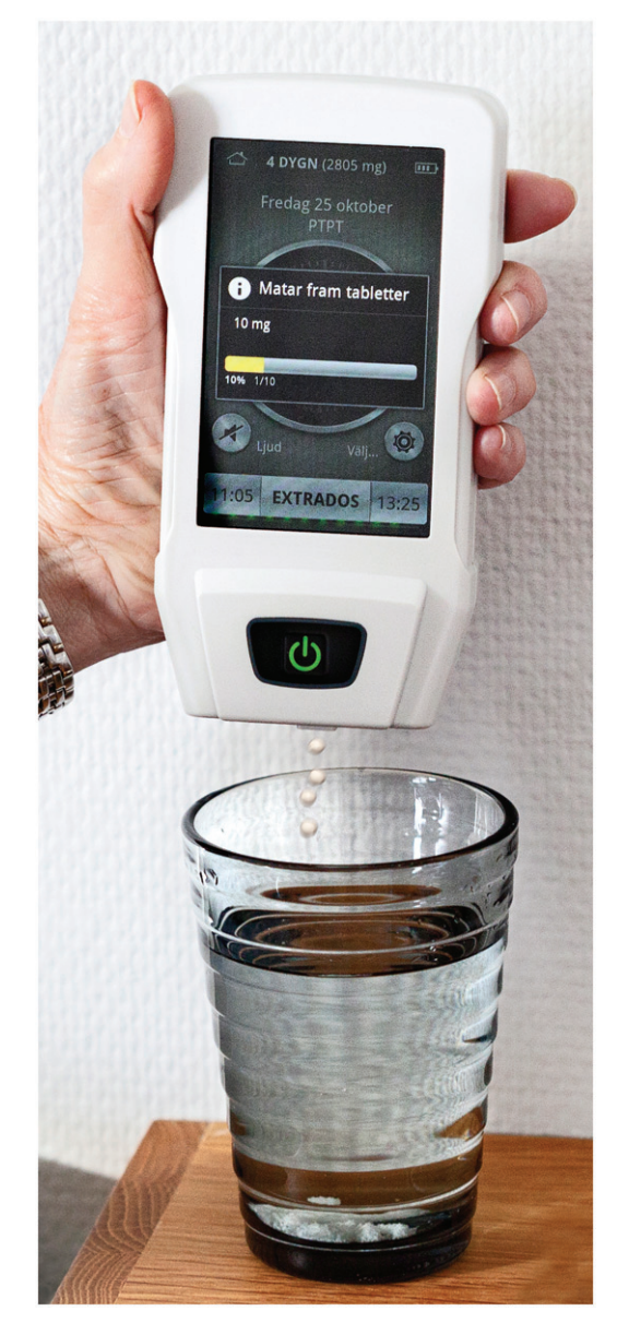
Figure 3. Automatic dose dispenser for levodopa/carbidopa microtablets.

A rapidly soluble tablet formulation containing 5 mg levodopa and 1.25 mg carbidopa was developed (LC-5, named