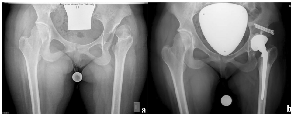
Fig. 1 a Preoperative radiograph showing chronic hip dislocation on the left with osteoarthritic changes. b Postoperative radiograph after THA and concomitant acetabular augmentation with the femoral head

The THA (exemplary Fig. 1a, b) were executed through a lateral approach. In one patient with a painful chronic dislocation a cemented dysplastic hip stem (CDH stem, Implantcast GmbH, Buxtehude, Germany) with a dual-mobility cemented acetabular cup (Ecofit 2M, Implantcast GmbH, Buxtehude, Germany) was used and was combined with acetabular augmentation using the femoral head [17]. The other three cases were not dislocated and were addressed using a small cementless stem with diaphyseal anchorage (Dialoc, Implantcast GmbH, Buxtehude, Germany) and a cementless porous coated shell with additional screw fixation on the acetabular side (Trident, Stryker Corp., Kalamazoo, MI,