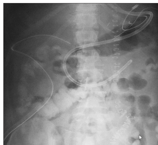
Figure 5: Abdominal X-ray in post laparotomy patient with postpyloric feeding tube

Endoscopic insertion is considered the gold standard for insertion of postpyloric feeding tubes with high