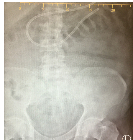
Figure 2: Image of abdominal X-rays showing successful placement of small-bowel feeding tubes

If the tube was not in the desired position, it was withdrawn back to 55 cm and the procedure repeated