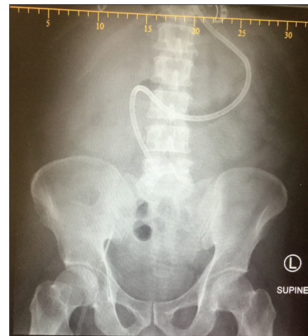
Figure 3: Abdominal X-ray showing postpyloric feeding tube in patient with high residual gastric volume

The role of prokinetic to facilitate placement of postpyloric tubes is debatable. [7,8] Since the use of metoclopramide as a prokinetics is a part of our feeding protocol, all patients with high GRV received at least two doses of this medications before small-bowel feeding tubes were considered. Although a GRV up to 500 ml can be acceptable without the fear of aspiration according to clinical studies, we accepted GRV of 200 ml to interrupt the feeding as our unit has a nurse-driven protocol. [9]