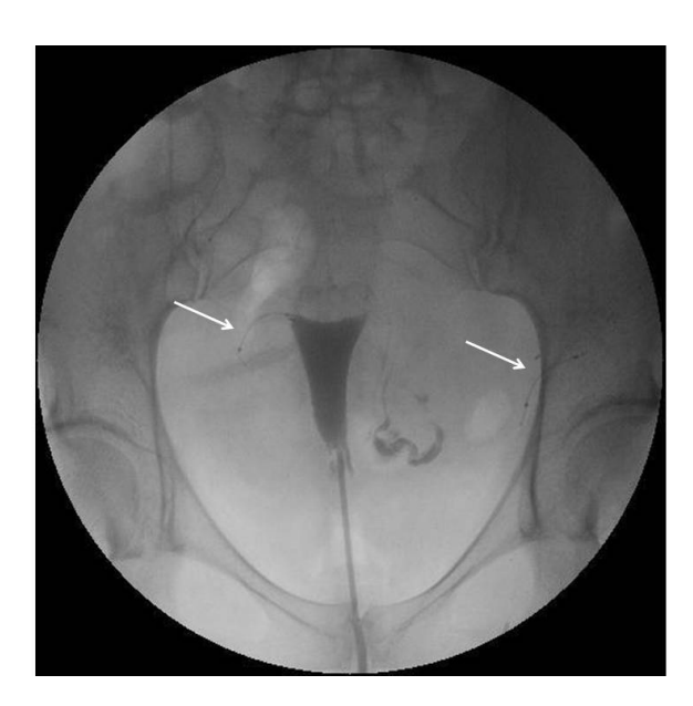
Figure 1 Hysterosalpingogram. Notes: Hysterosalpingogram showing tubal occlusion on the right side with correct location of the device (right arrow) and a patent tube on the left side. The left device is abnormally positioned (left arrow).

During the following weeks, the patient did not complain of any symptoms. The 3-month hysterosalpingogram (HSG) follow-up showed that the right tube was occluded and the device was correctly placed (Figure 1). Conversely, the left