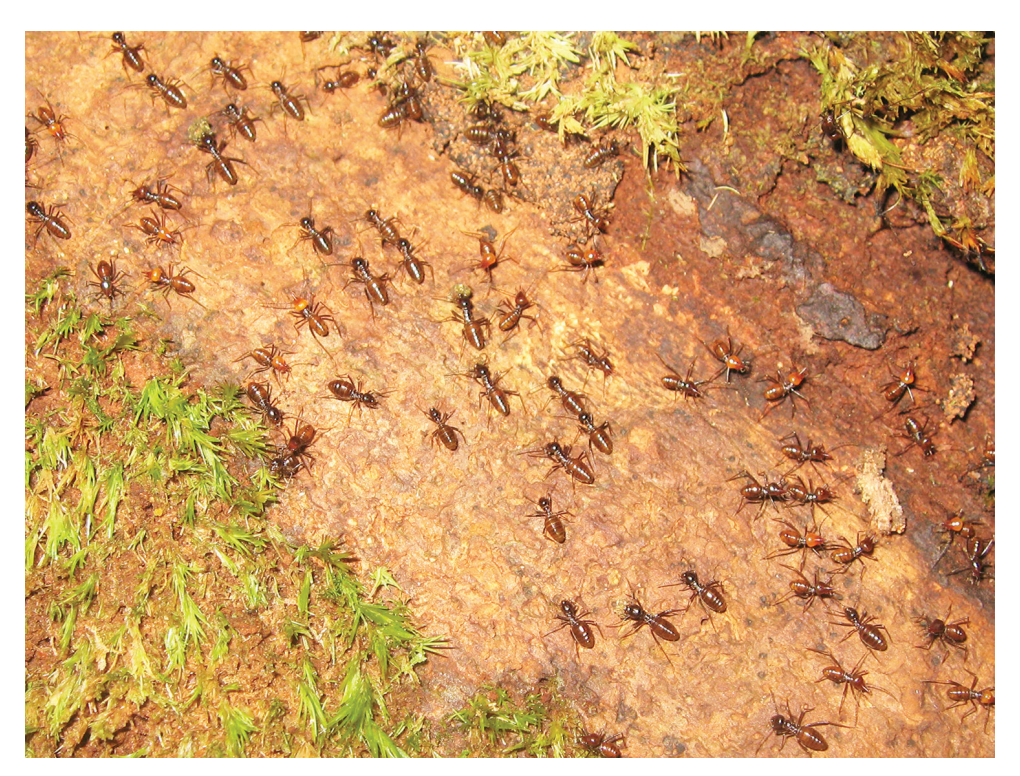
Figure 14. Foraging party of soldiers and workers of Hospitalitermes nigriantennaris sp. n. on the forest floor.

en masse). The holotype is deposited at Museum Zoologicum Bogoriense (MZB), Cibinong, Indonesia. Paratypes: soldiers and workers from C0019, C0036, C0037, C0043, C0045, C0051, C0052; will be depository at MZB, the Natural History Museum, London (UK), Natural History Museum Vienna (Austria), Syiah Kuala University, Darussalam, Banda Aceh (Indonesia), the Kitakyushu Museum of Natural History and Human History (Japan), and the American Museum of Natural History, New York (USA).