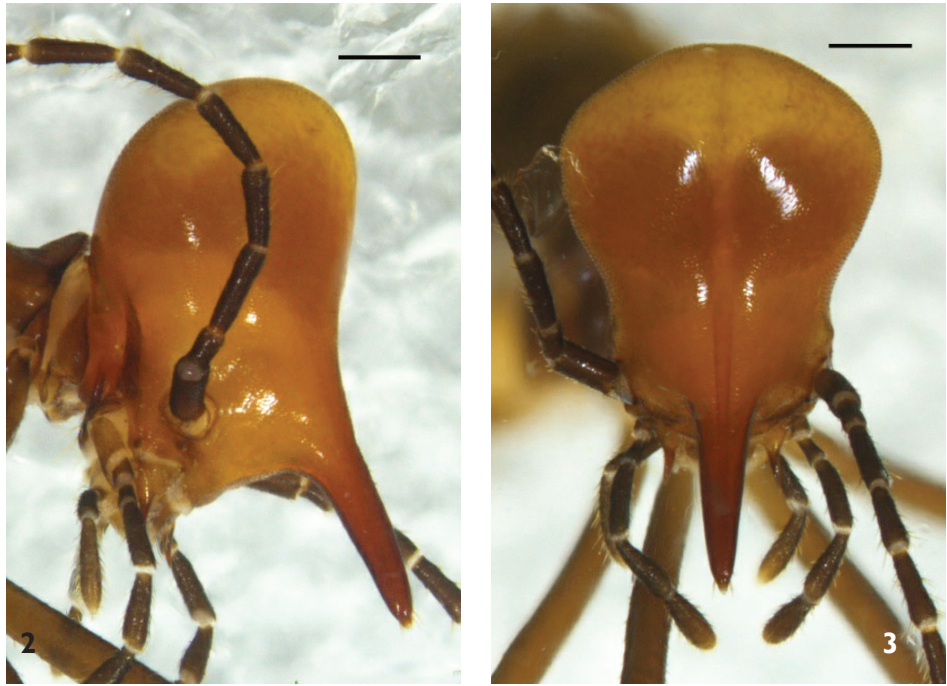
Figures 1–3. Soldiers of Hospitalitermes nigriantennalis sp. n. Habitus in profile (1), head in profile (2), head in dorsal view (3). Scale bars: 0.5 mm (1), 0.3 mm (2, 3).

anterior edge of first marginal tooth distinctly longer than posterior edge; second marginal tooth absent, incorporated into cutting edge between first and third marginal teeth; third marginal tooth smaller than first marginal tooth, weakly protruding from