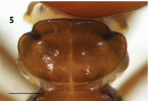
Figures 4–5. Soldier of Hospitalitermes nigriantennalis sp. n. Antenna ( 4 ) and pronotum ( 5 ). Scale bars: 0.3 mm ( 4 ), 0.2 mm ( 5 ).

cutting edge and separated from molar prominence by a distinct gap; fourth marginal tooth retracted, completely hidden behind molar prominence. Right mandible: first marginal tooth with anterior edge down-curved; second marginal tooth weakly recognized and separated from much larger first marginal tooth; posterior edge of second marginal tooth straight; outline of molar plate weakly visible; cockroach notch of molar plate absent.