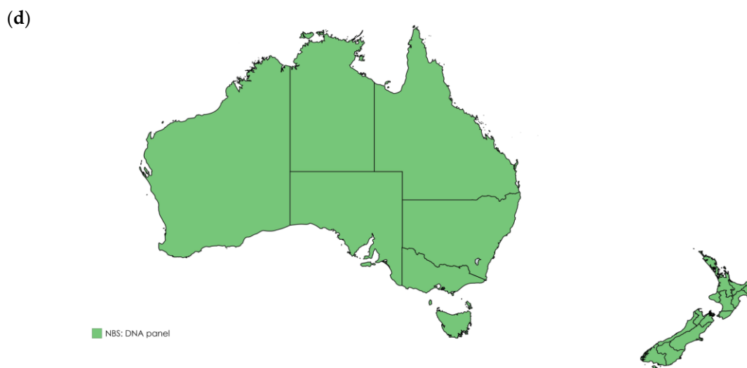
Figure 1. (a) In Europe, (b) in North America, (c) in South America, (d) in Australia and New Zealand. Newborn screening programs for cystic fibrosis (CF) according to the place of DNA analysis. NBS, newborn screening; EGA, extended CFTR genetic analysis.

Numerous programs have included a safety net protocol with the aim to identify CF infants who would be missed by testing variant panels because they carry two rare variants. Depending on the program, neonates with no variant but ultra-high IRT undergo either a second IRT measurement at 14–21 days or a direct sweat testing. In Denmark and the Netherlands, the safety net protocol leads to performing EGA. Safety net protocols lead to limiting false negatives cases, hence increasing the sensitivity of NBS programs, which is particularly effective in ethnic minority communities.