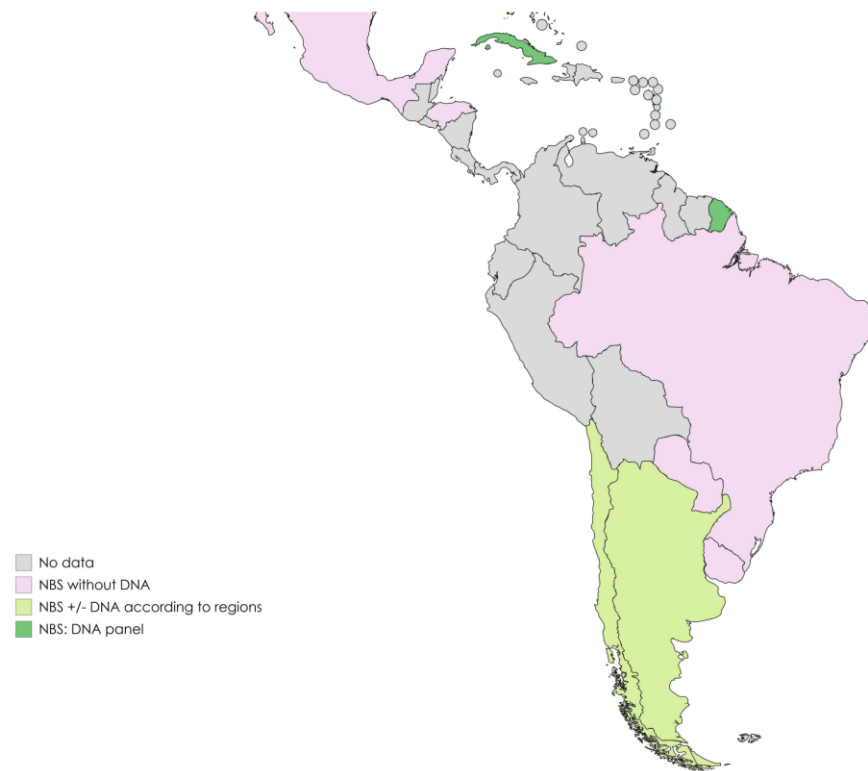
Figure 1. Cont.