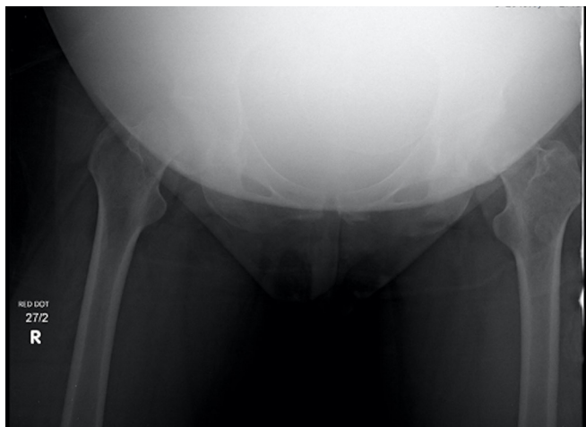
Figure 1 Initial radiographic imaging demonstrated bilateral subcapital neck of femur fractures.

The patient underwent an emergency LSCS under general anaesthesia to facilitate concurrent internal fixation of both neck of femur fractures using 4-hole dynamic hip screws (DHS) and bilateral antirotation screws; a management plan generated by