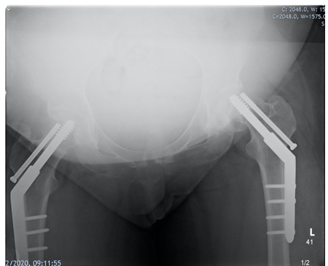
Figure 3 Radiograph taken four days postoperatively demonstrated failure of the left sided DHS.

On resolution of full weight bearing status, she was discharged from regular outpatient physiotherapy. A dual energy X-ray