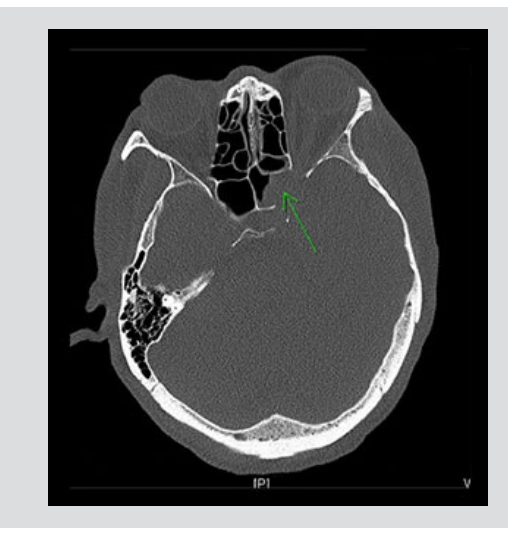
Figure 2. Green arrow indicating bony erosion of the left lateral wall of the sphenoid sinus.

Computed tomography (CT) of the sinuses with an image-guided surgery protocol demonstrated left sphenoid and posterior ethmoid sinus mucosal thickening, with bony erosion of the left lateral wall of the sphenoid sinus, adjacent to the left orbital apex ( Fig. 2 ).