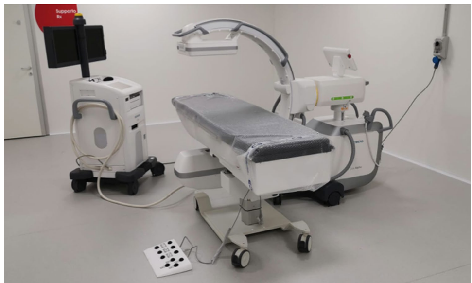
Fig. 6 Portable C-arm

For hybrid procedures, US machines may be taken from one of the modules, but must undergo strict decontamination SOP in between patients, despite the red zone location.