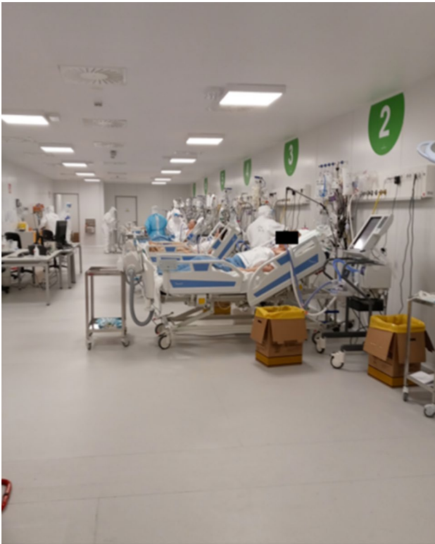
Fig. 2 Example of beds in each module

and complete compliance. Non-powdered latex-free gloves should be used by all operators. Eye protection and face shielding should be used. Gowns should be long-sleeved and made of non-absorbable (fluid-resistant) materials. The same gown should not be worn for all patients. In case gowns are not available, waterproof aprons should be used.