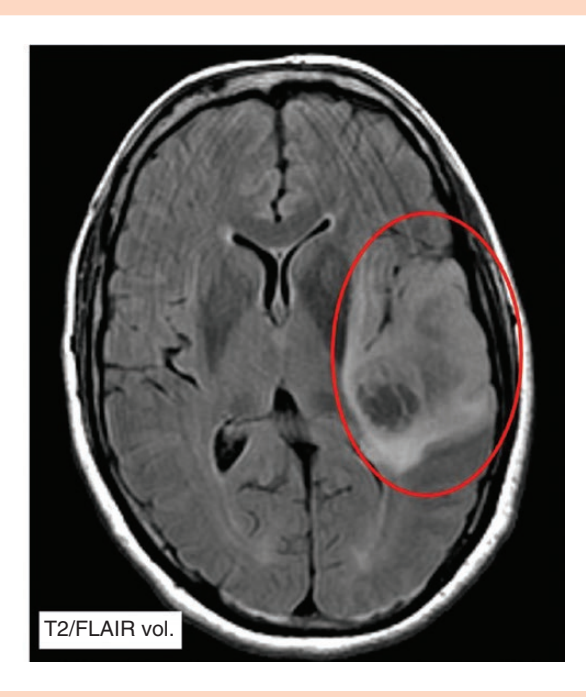
Figure 1. Representative MR images of a newly diagnosed GBM patient at presentation demonstrating a T1 gadolinium contrast-enhancing volume of 14.2 cm<sup>3</sup> (left) and T2/FLAIR volume of 104.4 cm<sup>3</sup> (right). In this patient, the T1/T2 ratio was 0.13.

variables with P values less than .1 in the univariate analysis to be potentially interesting.