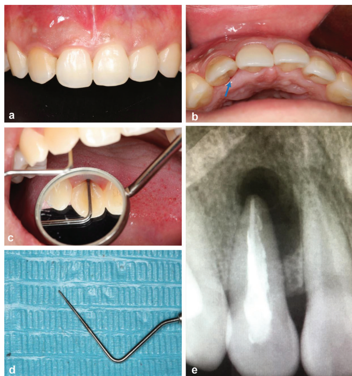
Fig. 1: (a) The maxillary right lateral incisor. A preoperative clinical photograph shows a draining sinus tract on the labial gingiva. (b, c, d) A palate-gingival groove was detected on the maxillary right lateral incisor, accompanied by a 15-mm periodontal pocket in the mid palatal region. (e) the X-ray radiograph shows the root canal treated image and oval shadow.

A 25-year-old woman in good general health came to the dental clinic department. She complained of pus discharging from her gingiva and discomfort in her maxillary right anterior quadrant. It had continued for six months, even the tooth was treated at another hospital. Based on the initial clinical examination, it showed that the labial mucosa of the maxillary right lateral incisor was swelling and a draining sinus tract was on it and exhibited positive responses to percussion and palpation (Fig. 1a). The clinical examination revealed the palatal access was completely filled with light curing composite and a subtle groove that extended from the cervical to root on the palatal side (Fig. 1b). The examination also revealed a deep, narrow periodontal pocket (PD=15mm) in the mid-palatal region with probing bleeding (Fig. 1c,d). The maxillary right lateral incisor was in physiological level with no pain and abnormal occlusion can be observed. Radiographs confirmed the upper right lateral