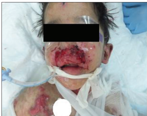
Figure 1: 5-year-old boy diagnosed case of dystrophic epidermolysis bullosa, immediately after induction of anesthesia