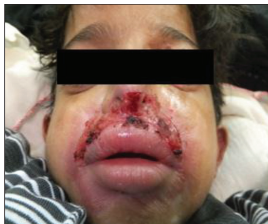
Figure 2: 5-year-old boy diagnosed case of dystrophic epidermolysis bullosa. Postoperatively after plastic surgical repair in post-anesthesia care unit