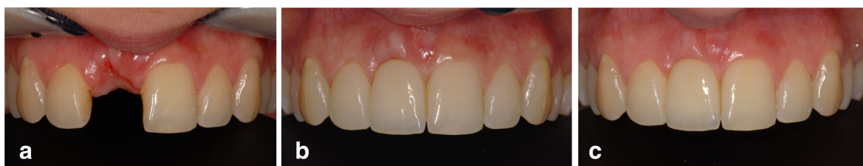
Fig. 2 Soft tissue changes. a Pre-implant situation. b One month after definitive restoration placement. c Twelve months after definitive restoration placement

The thickness of the labial bone wall at implant placement was insufficient in 10 cases (33.3%) and had to be augmented to achieve a labial bone wall thickness of at least 2 mm. The insufficient thickness could not be due to the type of bone used for the alveolar ridge preservation because the origin of augmented bone was evenly distributed between maxillary tuberosity and retromolar area. Apparently, placement of tapered implants in sites in which alveolar ridge preservation has been executed