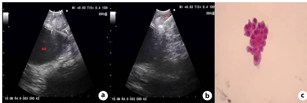
Fig. 3. a, b EBUS-TBNA image in B-mode showing a periaortic nodular lesion (white arrow) with the needle placed into the lesion (red arrow). c Cluster of pulmonary adenocarcinoma cells (HE stain, \times 200 ).

The detection of high level of FDG uptake on or close to the bronchial stump after curative surgery helps determine the target for biopsy or needle puncture in patients with suspicious of recurrence [5, 6].