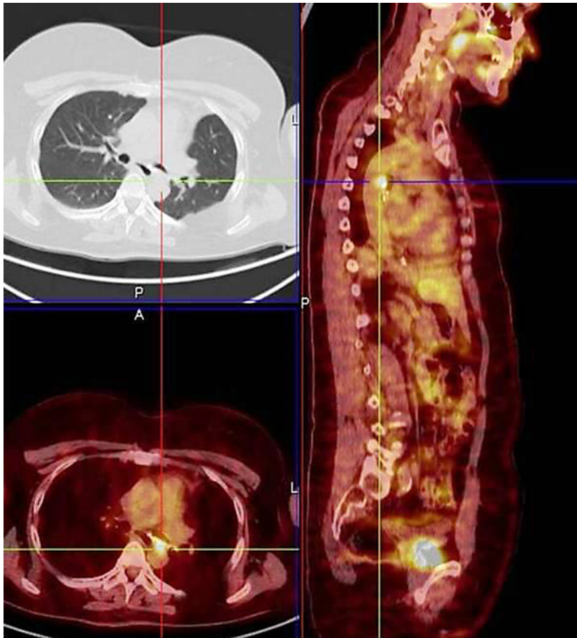
Fig. 1. PET/CT scan showing an avid 1-cm nodular lesion located between the posterior wall of the left main stem bronchus and the descending thoracic aorta.