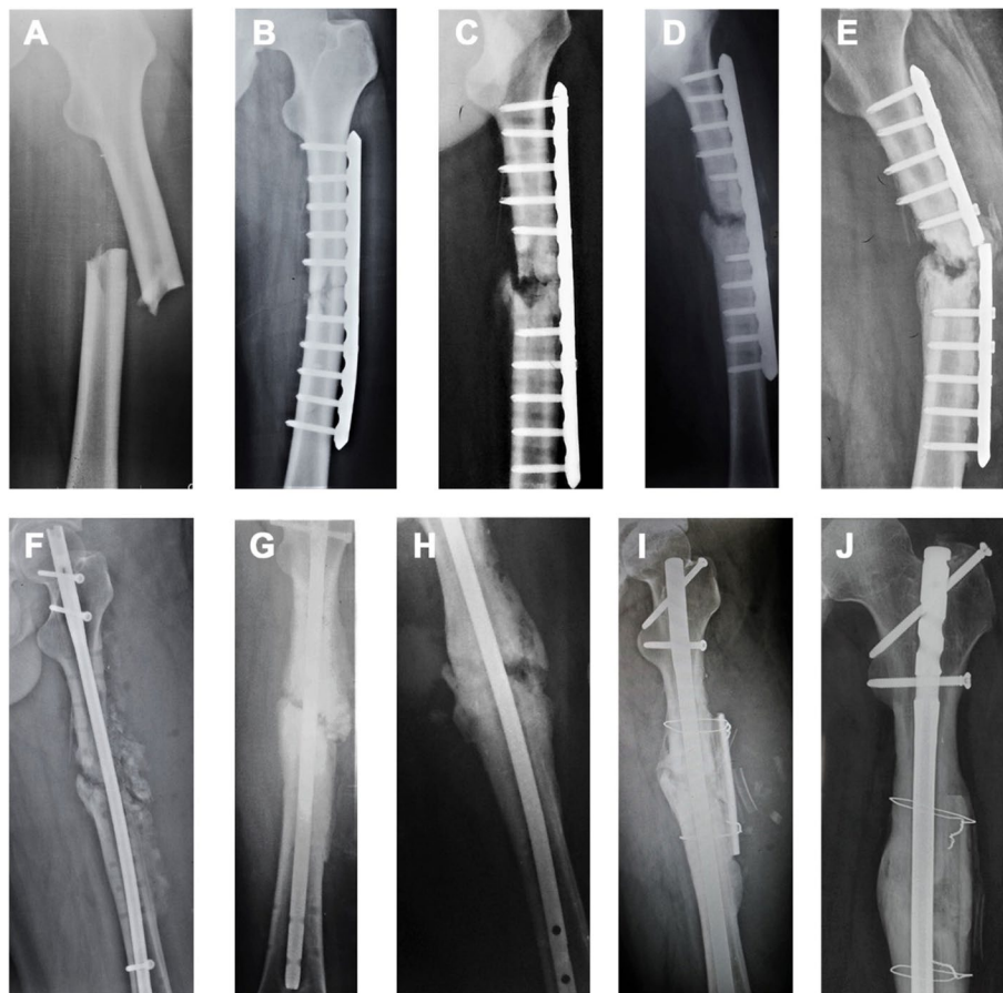
Fig. 2 A male, 26 years old, non-union of left femoral shaft for 23 months. A Displaced fracture of the left femoral shaft caused by a traffic accident. B Open reduction and internal fixation postoperatively. C Six months after the operation, the plate loosened. D The plate was re-fixed and bone grafted with autologous bone. E Six months after the second operation, the plate broke. F Intramedullary nail fixation and bone grafting with autologous bone. G Within 5 months after the third operation, the non-union site did not heal. And intramedullary nails dynamization was conducted with autologous bone grafting. H After the fourth operation, the non-union site still did not unite. I Intramedullary nail fixation. Due to the limited resources of the donor site, cortical allograft strut grafting was finally performed. J Allogeneic bone fusion and nonunion healing in 18 months after the final operation, and the shape was “biconvex.” The contralateral cortical site healed completely, and there was a creeping substitution between cortical allograft strut and femur. The periosteum of the femur has wholly crossed the strut

The treatment of long bone nonunion remains a considerable challenge for orthopaedists. This study showed that cortical allograft strut augmented with platelet-rich plasma could successfully treat long bone nonunions in the lower limb. Although autografts were fresh viable tissues with cancellous parts and the bone marrow, which were not only osteoconductive but also osteoinductive and osteogenic grafts, cortical allografts also have some superiority to autografts in terms of larger and longer size and more significant defects [7]. These echoed the findings of earlier research, and PRP seemed, to some extent, an attractive biological to enhance fracture healing [23]. The bone healing of nonunion on the midshaft clavicle, distal femur, forearm, humeral shafts, distal femoral was