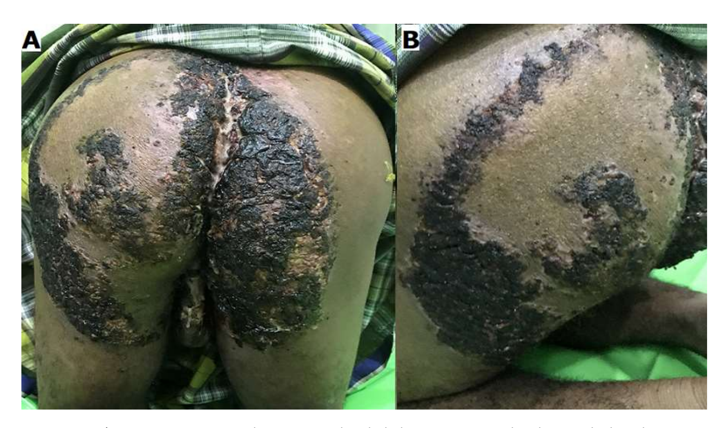
Figure 1 : A, B) extensive verrucous plaque covered in dark dense crust over the gluteus, thigh and scrotum with an irregular border; fissures were seen over the dense crust and multiple ulcers