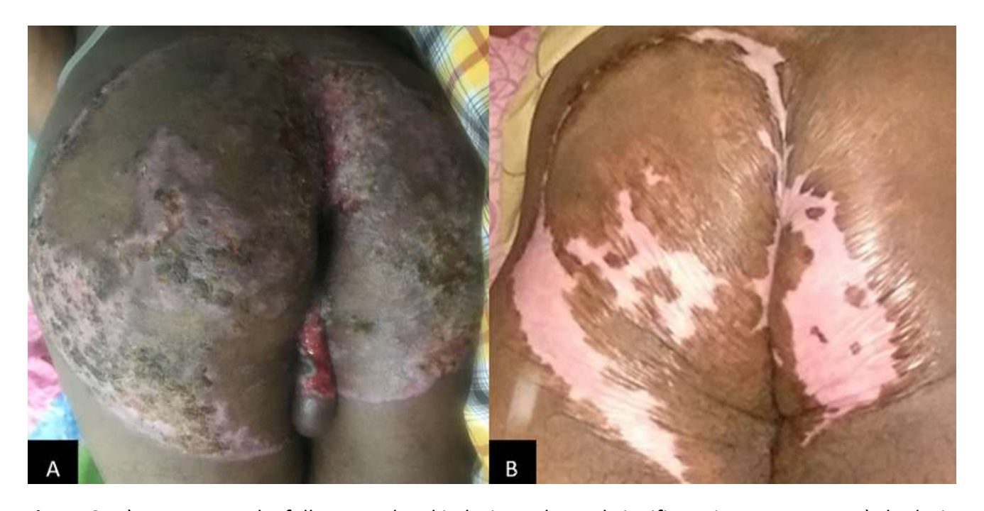
Figure 3 : A) at two months follow-up, the skin lesions showed significant improvement; B) the lesions were completely resolved after four months of therapy leaving atrophic scars