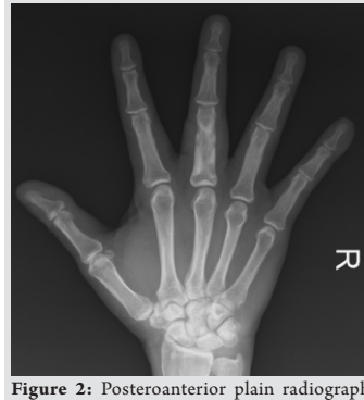
Figure 2: Posteroanterior plain radiograph increase bone density of proximal phalanx of third digit.