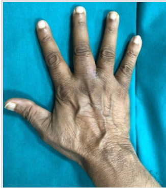
Figure 1: A swelling at proximal phalanx of third digit.