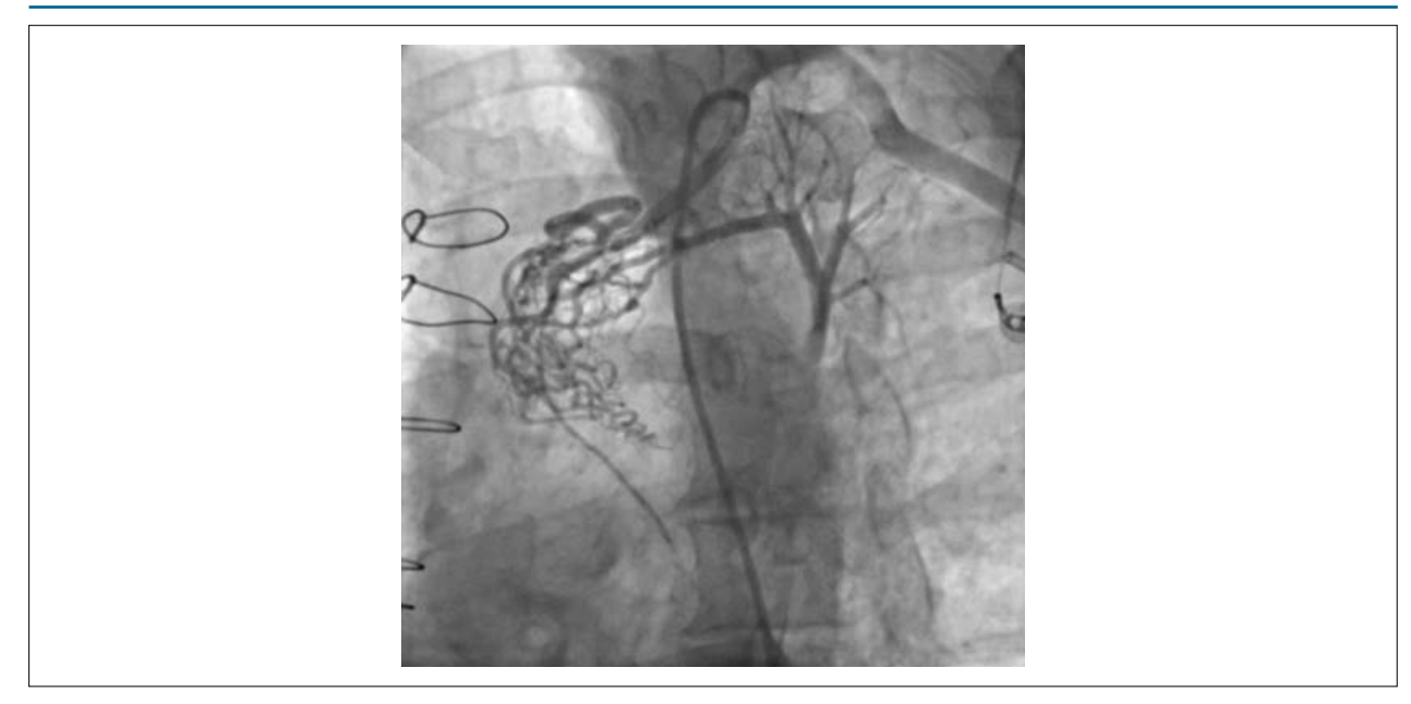
Figure 1 – The angiographic view of the fistula formation between LIMA and pulmonary artery.