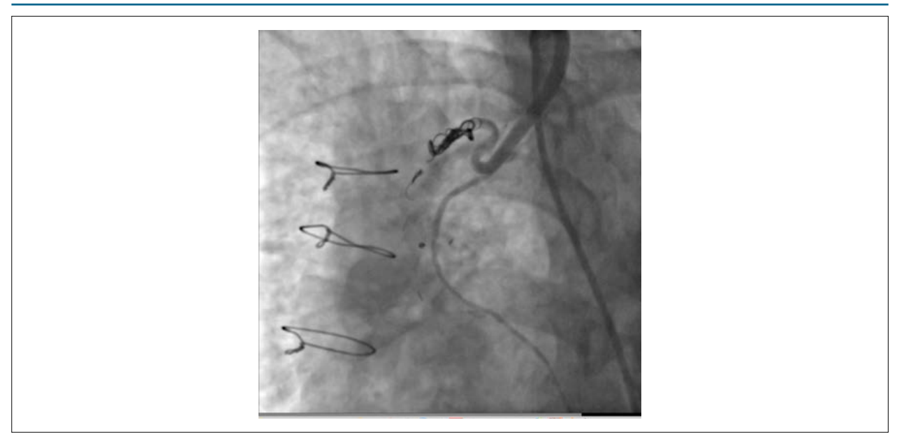
Figure 3 – Total occlusion of the fistula after additional coil embolization.

heart failure symptoms. Continuous murmur can be heard on physical examination. Although it is very unusual, such a fistula formation can be complicated by myocardial infarction, congestive heart failure, pulmonary hypertension, arteritis, aneurysm or rupture.<sup>6</sup>