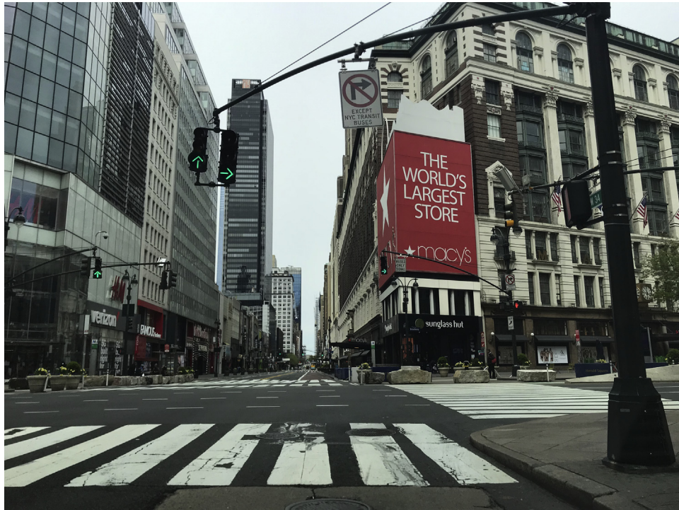
Fig. 1. An image of Macy’s at Harold Square in New York City taken from my car during COVID-19 stay-at-home order.

I reached home and went to sleep not knowing what tomorrow would bring.