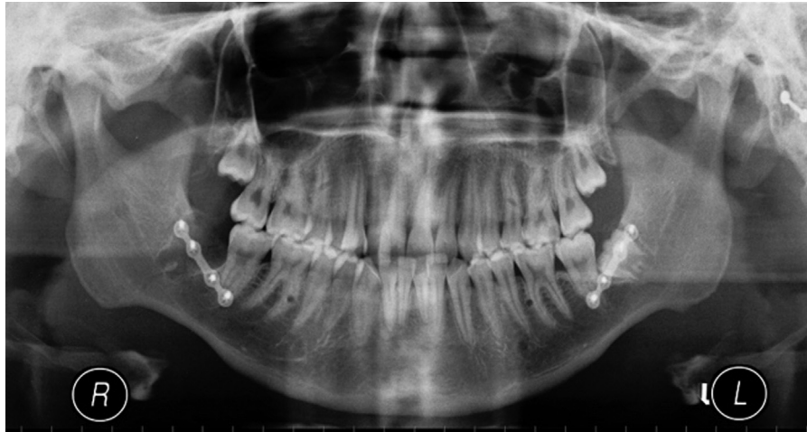
Fig. 1. Panoramic radiograph depicts root dentine involvement of the LR6, LL6, UL5 and UR5.