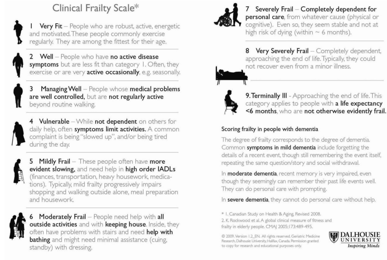
Fig. 3 Clinical Frailty Scale, CFS