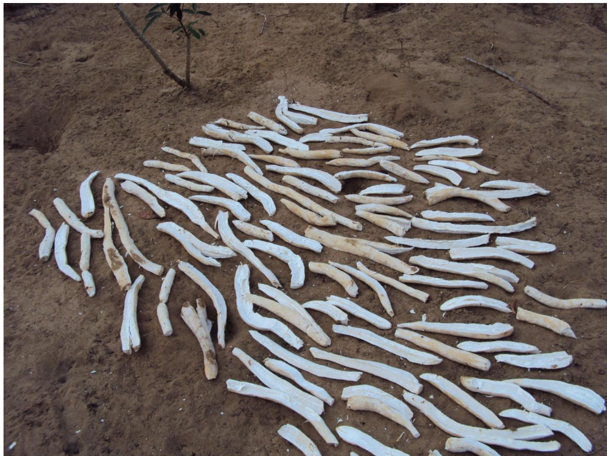
Fig 2. Cassava chips left to dry on bare ground.

https://doi.org/10.1371/journal.pone.0215527.g002