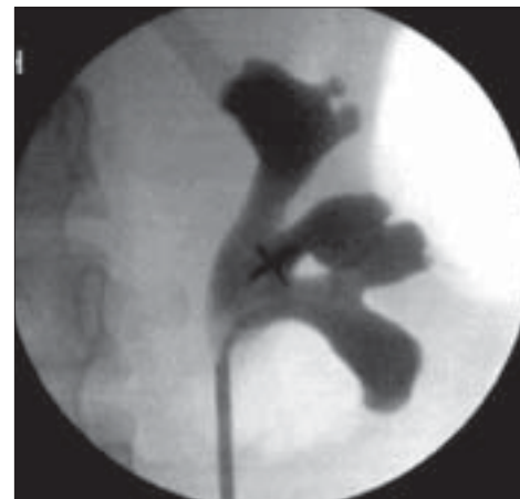
Figure 1: Retrograde pyelogram provides a road map for the flexible ureteroscope to enter desired calyx

Smaller stones can be grasped in a basket or stone-graspers and removed intact. Three- pronged stone-grasping forceps are the safest instruments for removing calculi. [16] They permit disengagement of calculi that are found to be too large to be safely removed from the ureter. This is important in RIRS, since there is no second channel