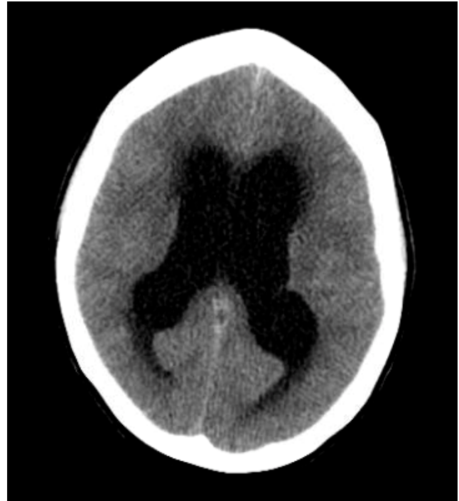
Figure 1 A: CT of the Brain without Contrast

Imaging studies are essential in the workup of patients presenting with symptoms suggestive of possible hydrocephalus. A CT brain without contrast is the initial test of choice. Approximately 2/3 of colloid cysts appear hyperdense on imaging. The lesions are usually round or ovoid and are well delineated. Most cysts range between 5-25