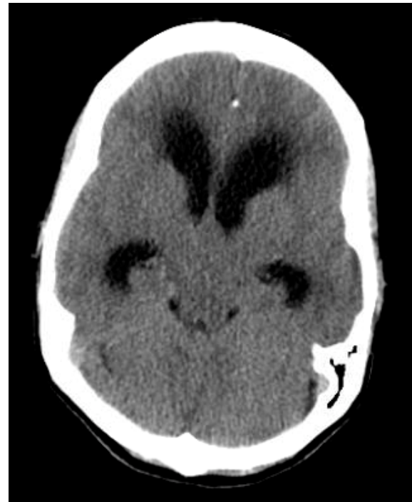
Figure 1 B: CT of the Brain without Contrast

A: Axial image demonstrating dilated lateral ventricles with transependymal edema