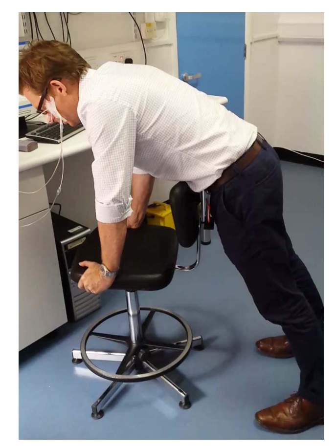
Figure 1 One of the authors (MH) performing a chair thrust on himself (see also online supplementary video).

The participant performed repeated maximal volitional cough and sniff manoeuvres. All manoeuvres were performed after exhalation to the end of a normal breath (at functional residual capacity) with mouth and glottis closed and a nose clip in situ.