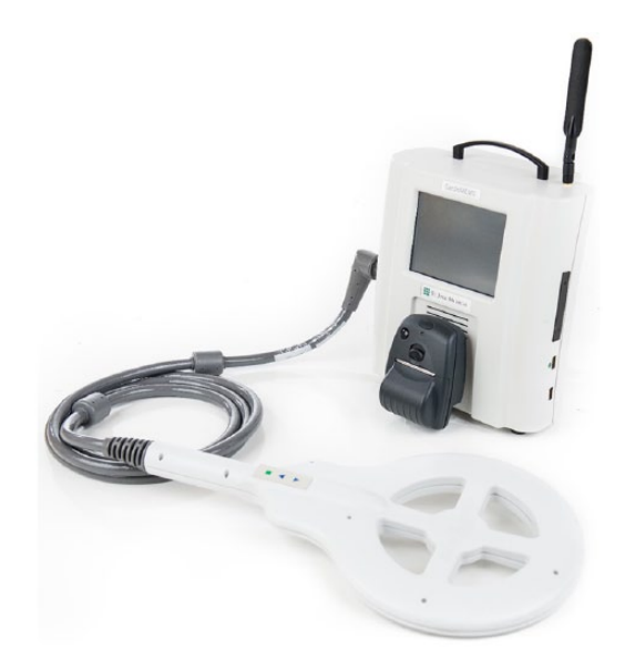
Figure 4. Hospital electronics system.

embolism, unable to tolerate a right heart catheterization, patients with an estimated glomerular filtration rate <25 ml/min who are unresponsive to diuretic therapy or on chronic renal dialysis, congenital heart disease or mechanical right heart valve, known coagulation disorders, hypersensitivity to aspirin or clopidogrel, patients who have undergone implantation of CRT-D within the past 3 months, body mass index (BMI) > 35 kg/ m<sup>2</sup> and chest circumference >165 cm.<sup>30</sup>