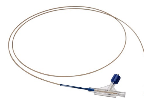
Figure 2. CardioMEMS delivery catheter. MEMS, Micro-Electro-Mechanical System.

conjunction with symptoms and signs of HF to guide modifications of medical therapy.