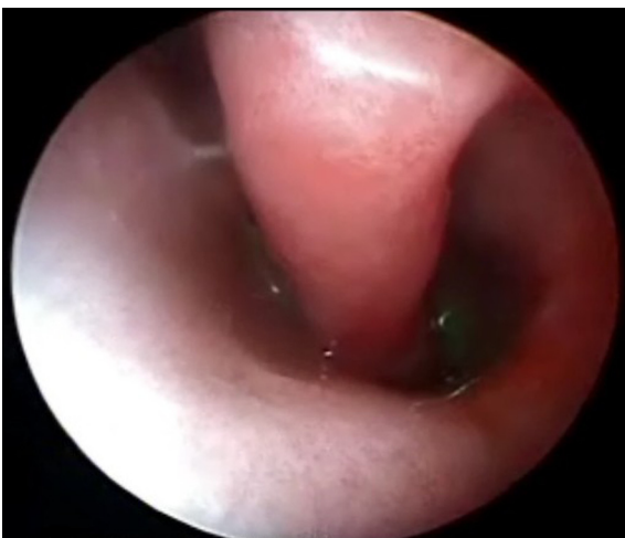
Figure 1. Nasal endoscopic view shows free flow of fluorescein under the inferior turbinate.