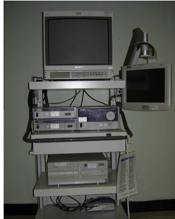
Figure 5. A High-Tec nasal endoscope which is used in endoscopic sinus surgery.

a primary procedure in most cases of CNLDO, although it may be helpful in failed cases. 13,40