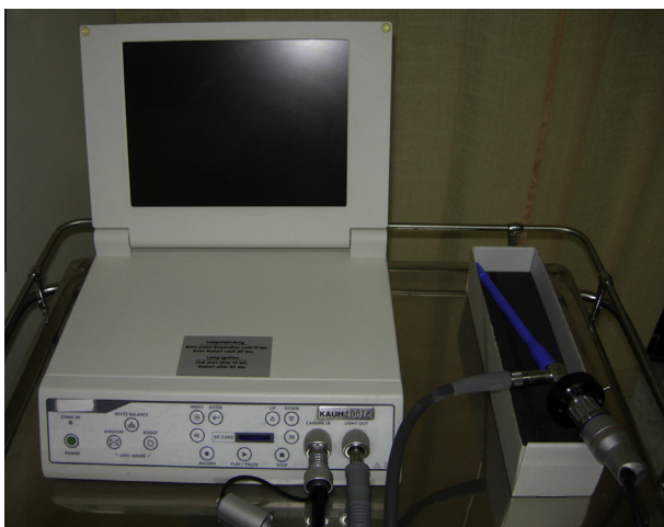
Figure 4. A portable compacted nasal endoscope which is suitable for endoscopic assisted probing.

It is worthy to mention that the aforementioned limitations have been admitted by some researchers who concluded that nasal endoscopic-assisted probing may be excessive as