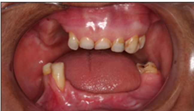
Figure 1. Initial intraoral photograph of patient 1.

A 50 year old, 65 kg female patient was referred to the Prosthetic Department of Selçuk University for rehabilitation of their oral function and aesthetic. She had malformed anterior teeth in the maxilla and left first