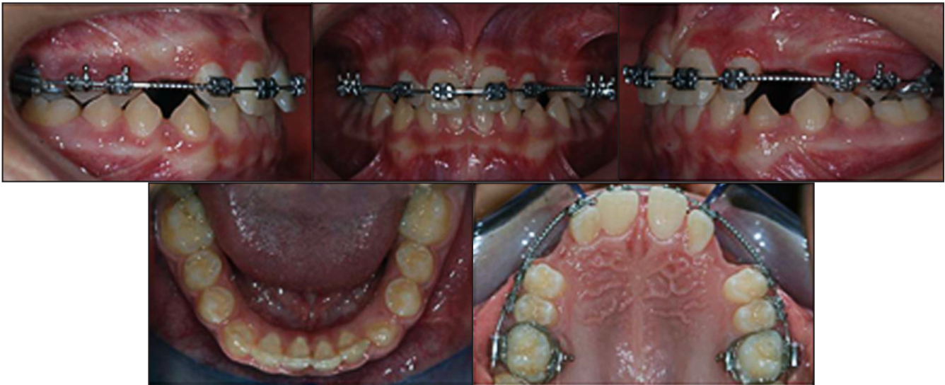
Figure 4. Intraoral photographs of patient 3 after bracket bonding.

and somatogenic [7,8]. Anatomical abnormalities or neural hypersensitivity in the oropharynx have been identified as somatogenic factors in the development of the gag reflex [7]. In a previous study by Saita et al. [9], it was reported that psychological factors were identified in all patients with strong anxiety indicated as the probable cause of the gag reflex. However some authors were stated that the gag reflex was caused by touching the oral mucosa in most of patients with some difference in degree of severity. In our patients, a pre-treatment oral examination was not performed to determine gagging severity but a hypersensitive gag reflex was developed during taking impression in all patients. However it may not be easy to distinguish between two aetiological factors because physical stimuli may still provoke gagging of psychogenic origin [7].