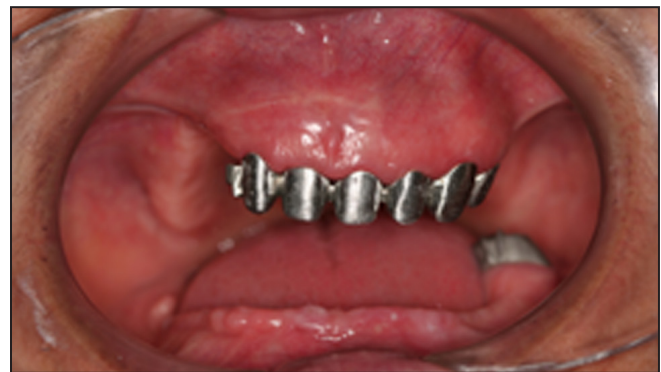
Figure 2. Metal framework try-in procedure of patient 1.

An 11 year old, 45 kg child patient was referred to