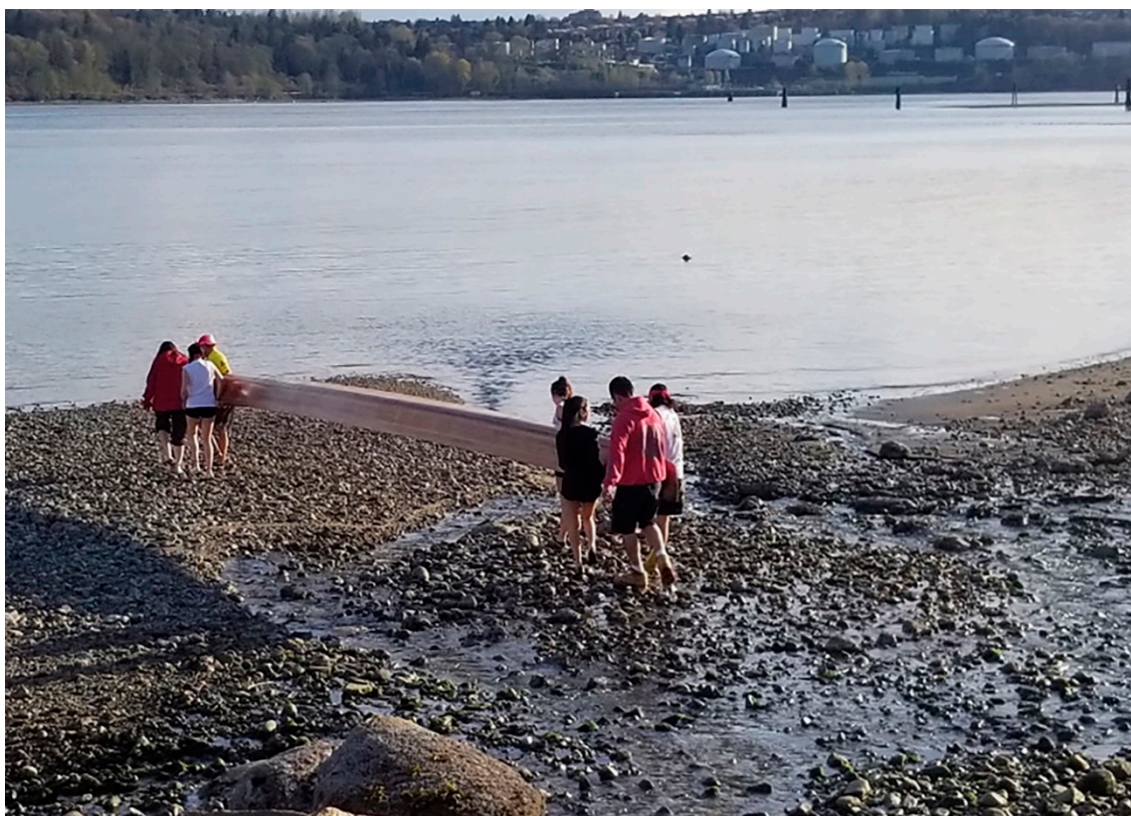
Figure 1. The canoe photo.

He then went on to explain how he heard that the color of the water has changed and he himself noted that he could feel the silk of oil on his skin. “If you don’t shower right away you get rashes . . . The water that heals and teaches you is so polluted by colonization.”