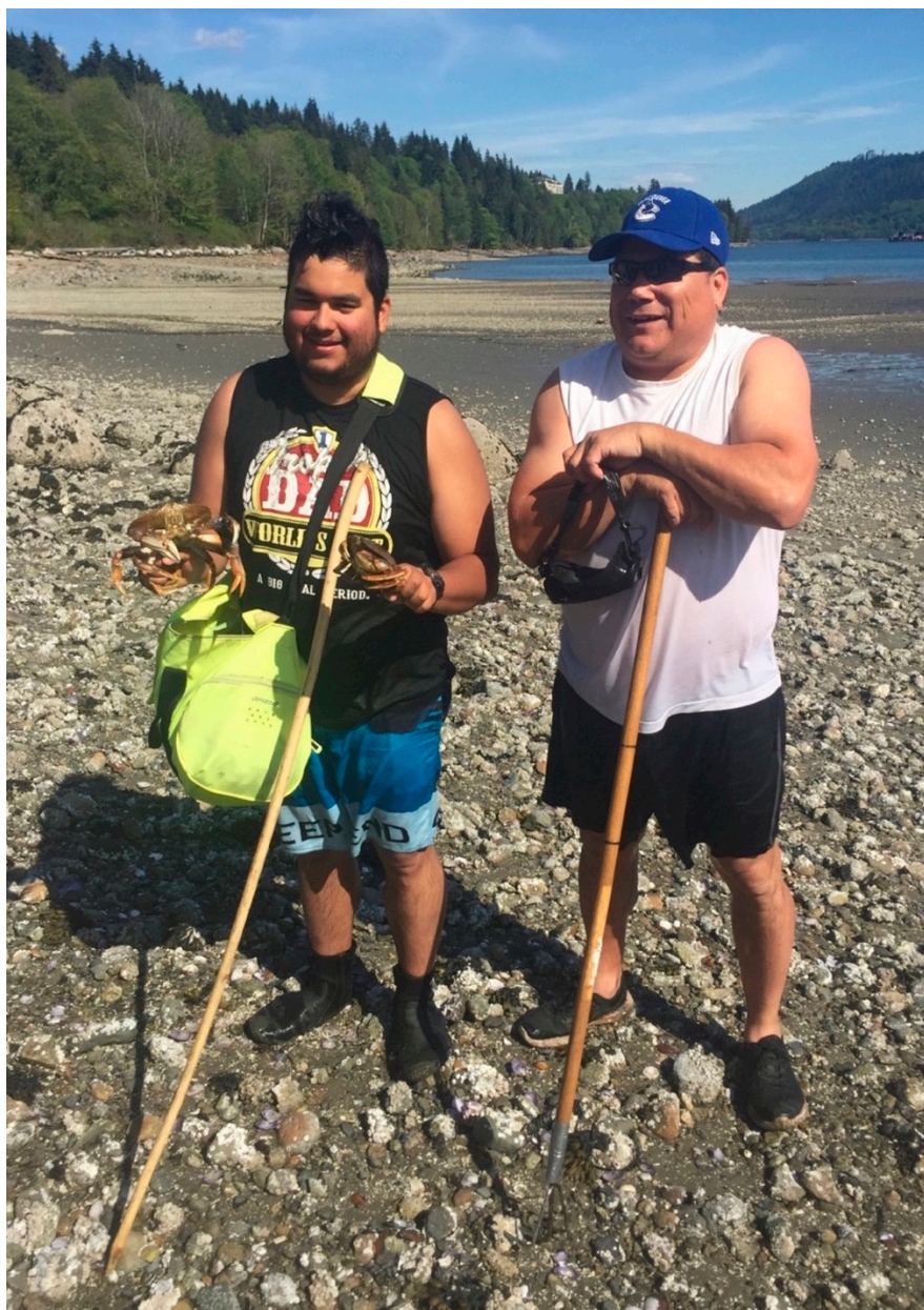
Figure 5. Crab fishers.

of them. The other family is the two guys that were out. Their sister - she never stopped living off the beach and she suffered with cancer for years and years. . . . We can't prove that it was the beach - but I want to ensure that their stories are told and never forgotten.