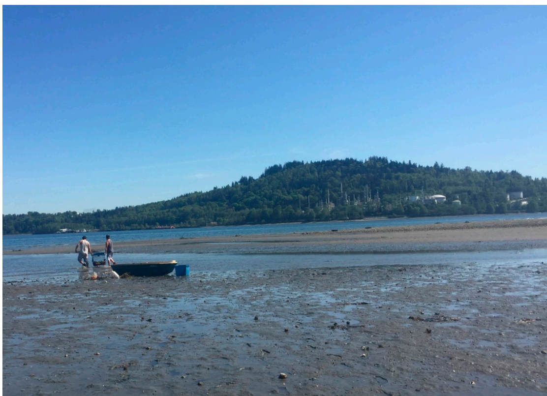
Figure 4. Crab fishers.

Another elder at the photovoice session explained how he saw his first red tide in 1951 and there another did not occur until 1958, “then it was once a year in the seventies. Now, if it is a hot summer there can be three red tides”. He lamented that he used to take the children swimming but now it is too dangerous, not only because of the high tides but because of the water quality; he explained how he scratched himself on barnacles and the wound quickly became infected, such that he stopped harvesting clams in the mid-70s as he “does not trust the water” anymore. Continuing the conversation yet another elder explained that he and his gang used to go fishing for tommy cod, “there were so many fish you could practically scoop them into the boat. It was like they were trying to jump in.” He said that his grandson told him he was going to be a fisherman and when asked why, he responded that his whole family were fishermen. Pursuing this theme further, a young participant talked about how she used to dig clams with her grandmother; “they used to soak them in a bucket of fresh water with rolled oats to get them to spit out the sand” as a means to clean them. To underline the importance of seafood to the TWN diet, another participant reminded the researchers: “We had a saying here: When the tide goes out, the table is set”. Yet another, who continued to harvest crabs, explained: