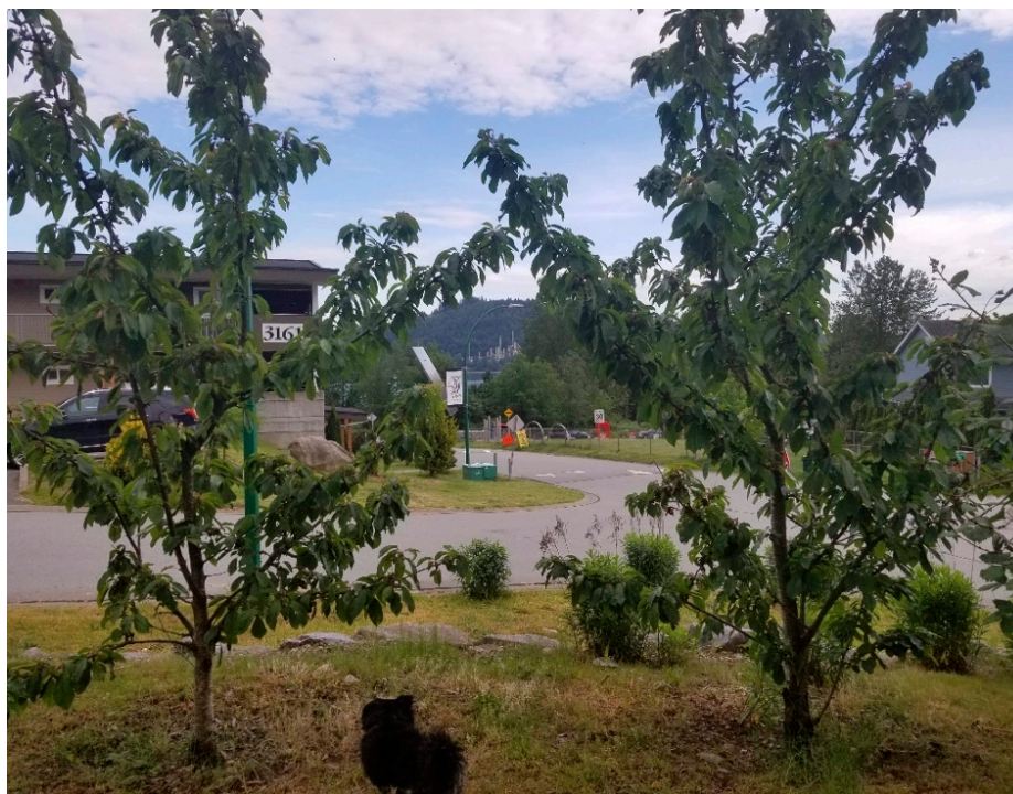
Figure 7.

The future's embrace of sustainable technology versus the outdated clutch to fossil fuels as the main means of energy creation, sustainable technology. "A point of pride for my nation is our drive toward self-sufficiency and our investments towards cleaner self-sustaining technology. Our solar panels and wind towers are steps in the marathon that is our journey.