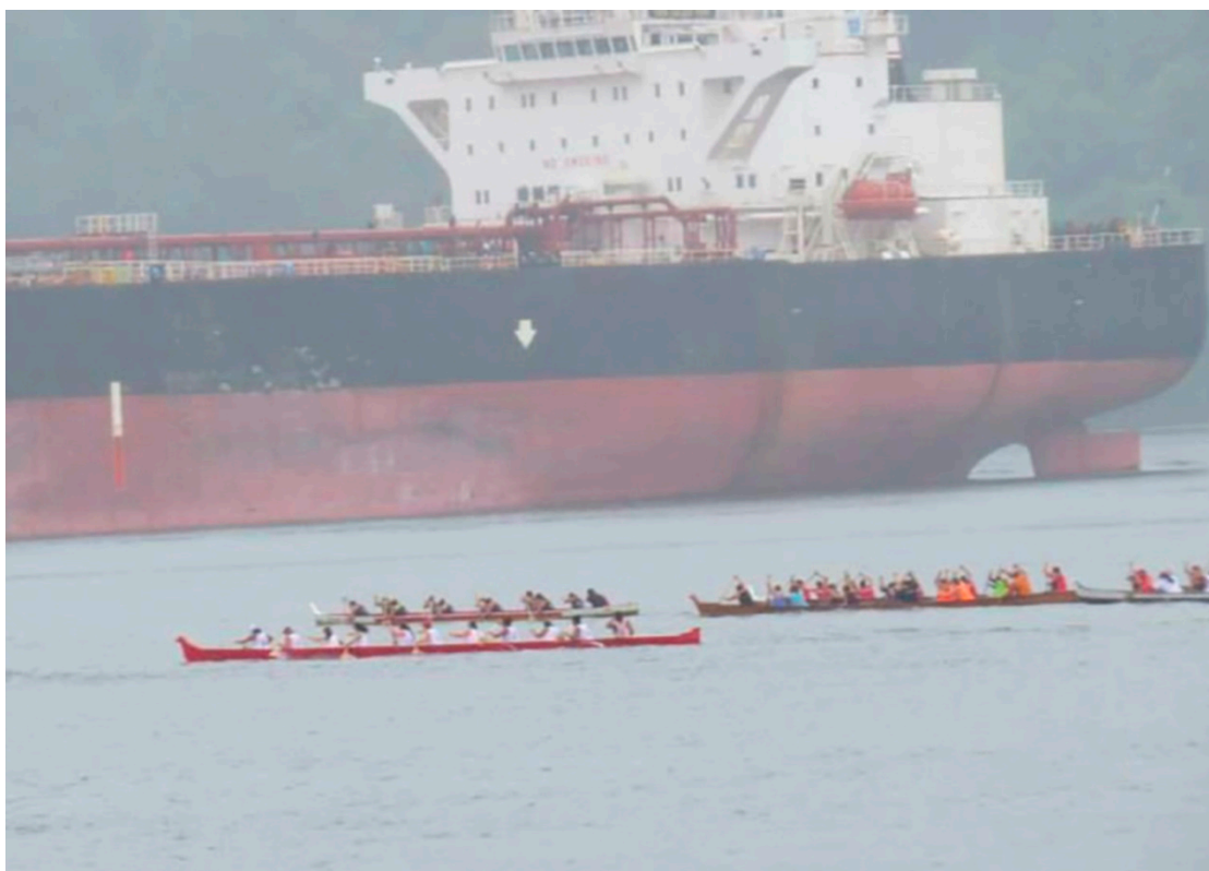
Figure 2. Showing a canoe beside a tanker.

In addition to the content of the narratives, the shared experiences and even the similarity of the visuals chosen, provided a clear counter to the dominant narrative promoting oil pipelines and tanker traffic.