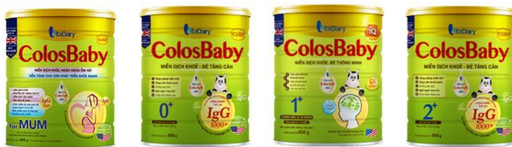
Figure 8. Cross-promotion of products in ColosBaby product line, with almost identical packaging and labeling [22].

Cross-promotion not only creates brand identity (and presumed brand loyalty), but it also confuses consumers. For example, follow-up and toddler milks are frequently mistaken by parents and caregivers for standard infant formula [24]. Studies in Australia and Italy found that 67% and 81% of mothers, respectively, reported seeing an infant formula advertisement when in fact they saw an advertisement for a toddler milk formula, which is not prohibited by local law [25,28]. Cross-promotion of BMS with other CMFs is thus potentially dangerous, undermines breastfeeding, and violates the Code [29].