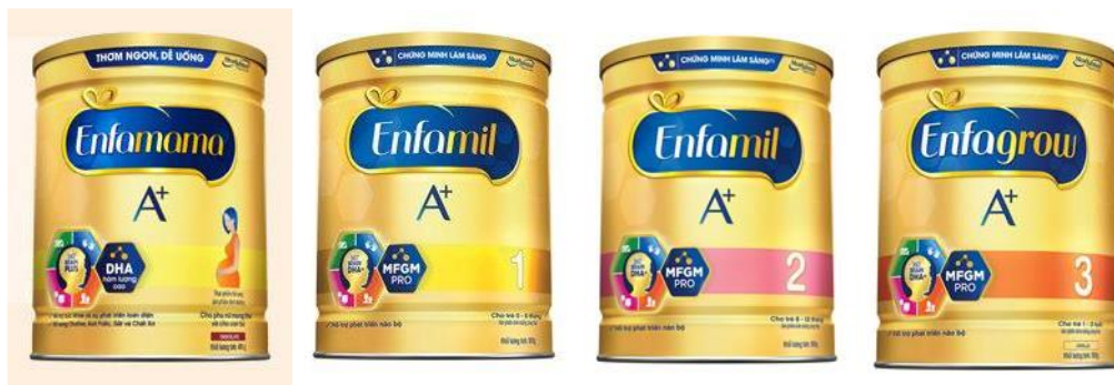
Figure 6. Cross-promotion of products in Enfa product line, with almost identical packaging and labeling [27].

PRO" for Enfa products; the Eye-Q icons for Similac products), serving to promote multiple claims and to distinguish the range of branded products from others.