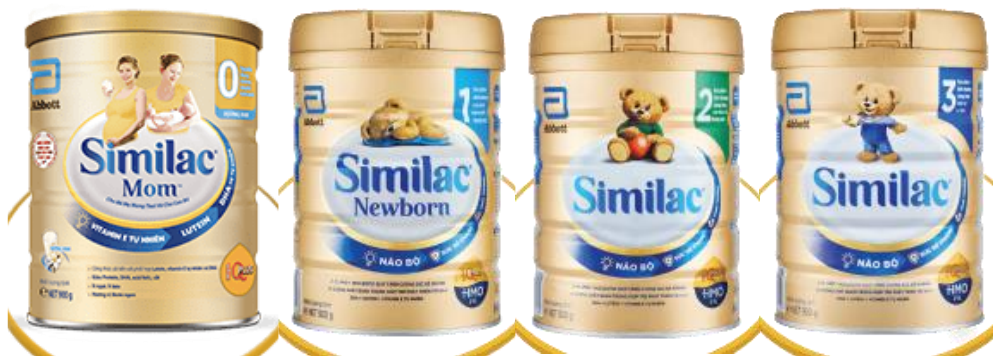
Figure 7. Cross-promotion of products in Similac Eye-Q product line, with almost identical packaging and labeling [8].