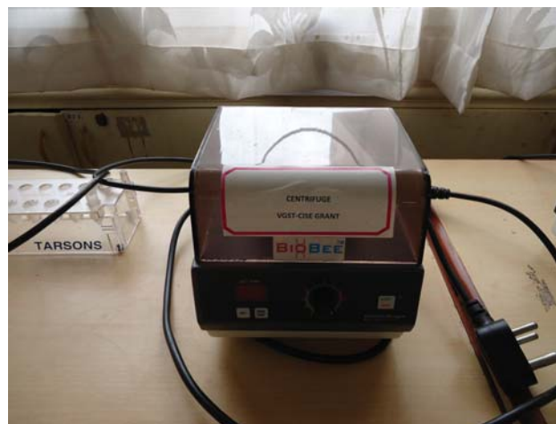
Fig. 2 Centrifuge.