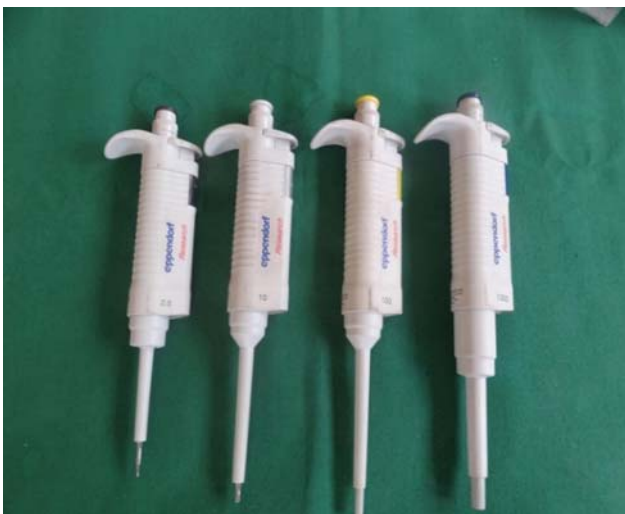
Fig. 4 Micropipettes.

After dilution was done, one drop of freshly prepared 2 to 5% of pooled cells of A,B,O blood group were added separately in the test tubes, centrifuged later and checked for the highest reagent dilution. Then the antisera with the highest