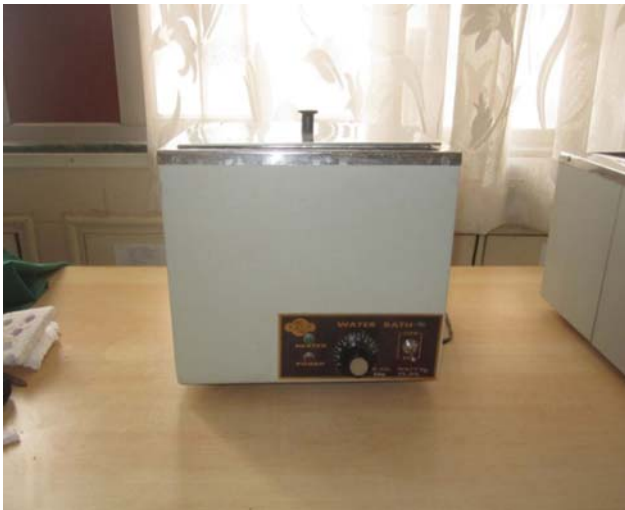
Fig. 3 Water bath.