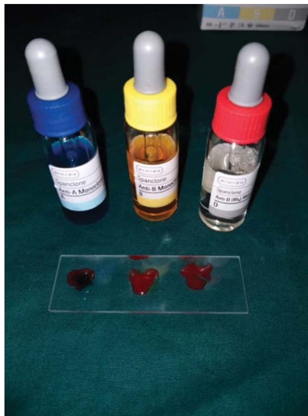
Fig. 1 Antisera kit.

Specimen collection: Five to 10 mL of unstimulated saliva was collected from the subjects using spitting method. Saliva was transferred into sterile test tube, centrifuged at 1,700 rpm for 8 to 10 minutes as shown in ►Fig. 2 and placed in a boiling water for 10 minutes (►Fig. 3); later supernatant was separated and recentrifuged at 1,700 rpm for 8 to 10 minutes and diluted with equal volume of saline and stored at -20°C temperature.