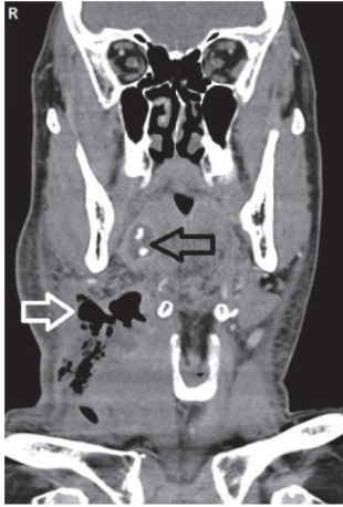
FIGURE 1: Coronal neck CT image showing cervical subcutaneous gas (white arrow) and right inflamed submandibular gland region with ductal stones (black arrow).