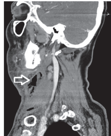
FIGURE 3: Sagittal neck CT image showing cervical subcutaneous gas (white arrow).

Meleney described subcutaneous tissue necrosis caused by streptococcus in 1924 and used the term of “streptococcal gangrene” [12]. It is known that necrotizing fasciitis shows different behavior in each area. Necrotizing fasciitis is divided into two subgroups in the head and neck region. The first group involves the eyelids and scalp, with infection generally developing after trauma. The second group is seen rarely and shows involvement of the face and neck. Although the most common etiologic cause is dental infections, other reasons include trauma, peritonsillar abscess, osteoradionecrosis, infections of the tonsils or the pharynx, injury, foreign bodies, cervical adenitis, surgical wounds, tumors, and salivary glands [11, 13]. In addition to these, sialoadenitis with ductal stones may lead to necrotizing fasciitis by forming abscess [11]. In our case, sialoadenitis with ductal stones was